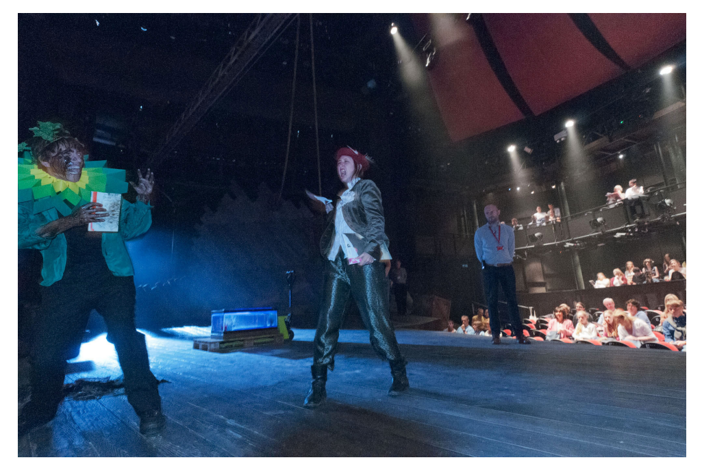
Fig. 4. The Reclaim Shakespeare Company (now known as BP or not BP?) performing a guerilla Shakespeare action on stage at the Roundhouse Theatre, Camden, 2012.