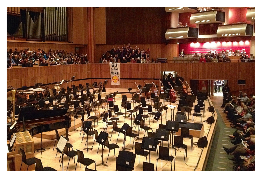
Fig. 2. Shell Out Sounds pop-up choir intervention at the Shell sponsored performance by the Sao Paolo Symphony Orchestra in the Royal Festival Hall, Southbank Centre, London, 2013.

To theorize the unique approach these critical collectives adopt, it is necessary to look to Critchley's meta-anarchic strategy of taking an interstitial distance to the state, which he sets out in the final chapter of Infinitely Demanding: Ethics of Commitment, Politics of Resistance (2007). Beginning from the premise that the state is an inevitable feature of the contemporary political landscape, Critchley proposes that the best course of action for radical politics is to operate within the state, but at an arm's length distance to it. He describes this distance as an interstitial or internal distance within state territory that needs to be opened from the inside with the goal of radically disturbing and undermining the machinations of the state from below. Unlike conventional politics, then, Critchley's strategy of interstitial distance is an antipolitics; it operates independently of state politics, but in tandem with it. This is an important distinction, because Critchley considers conventional (state) politics to be archic insofar as 'It is obsessed with the moment of foundation, origination, declaration, or institution that is linked to the act of government, of sovereignty, of establishing a state' (2007: 128). His antipolitics in contrast, is anarchic (Mahony 2014).