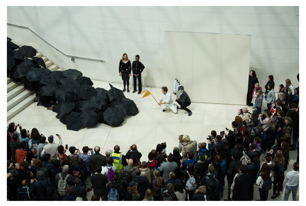
Fig. 3. BP or Not BP? in collaboration with Reverend Billy and the Stop Shopping Choir recreate Deepwater Horizon Oil Spill inside British Museum in protest at BP sponsorship, 2015.

The critical distance these collectives assume is underscored by the fact that, unlike Institutional Critique, which was often invited by the institution it was attacking, their actions are not sanctioned; they are entirely unauthorized interventions that take place on their own terms and without any prior notice.