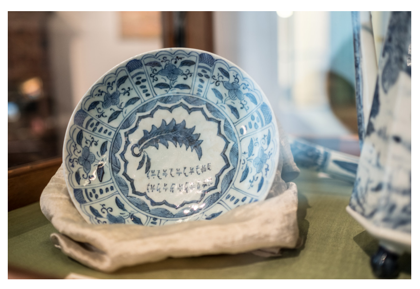
Figure 1: installation shot of Mobile Worlds, 2018: Plate with sheet and pseudo-Chinese script in Chinese Kraak style with pseudo branding on the ground in Chinese style, Iran, Safavid dynasty, 17th century, Museum für Kunst und Gewerbe, Hamburg