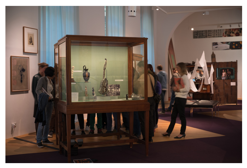
Figure 2: installation shot of Mobile Worlds, 2018