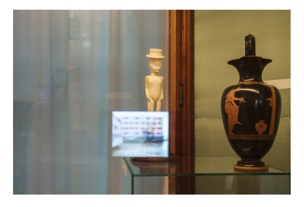
Figure 3: installation shot of Mobile Worlds, 2018