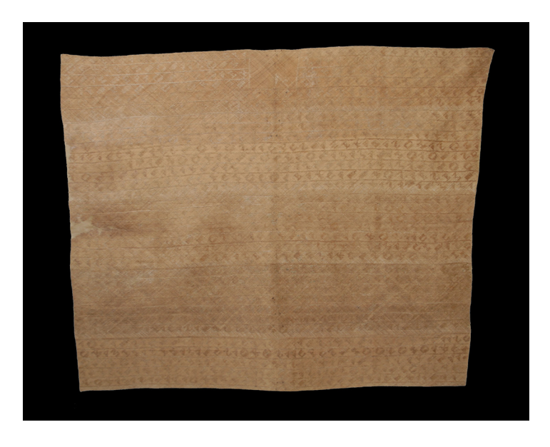
Fig. 3. Makaloa mat, woven by Kala'i-o-kamalino from the island of Ni'ihau, 1874.

public understandings through, ethnographic museums in Europe and the Americas.