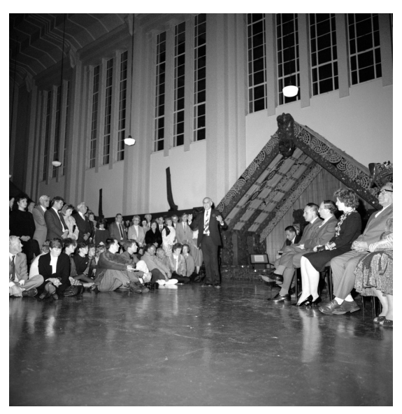
Fig. 2. Professor Hirini Moko Mead, academic and curator of the exhibition Te Maori, seen giving a talk at the National Museum, Wellington, Aotearoa New Zealand, 1986.

long history of Indigenous engagement with the method, the practice, the doing of curation – in this case, through the figure of the kaitiaki , the guardian, caring for taonga , or treasures. In figure 1, one sees the Māori carver Thomas Heberley directing work on the carved store house Te Tākinga in preparation for the opening of the Dominion Museum in Wellington in the mid-1930s. In figure 2, Professor Hirini Moko Mead, academic and curator of the exhibition Te Maori , is seen giving a talk at the National Museum in Wellington in 1986. The Te Maori exhibition was a milestone in the so-called Māori cultural renaissance. First touring several high-profile institutions in the United States, it returned to Aotearoa New Zealand to make an impact upon Indigenous resurgence, revitalization and sovereignty (McCarthy et al. 2019). Exhibitions, as these examples show, do not simply represent, and they also do more than simply mean. They intervene in the environments in which they are embedded, remaking and redoing worlds.