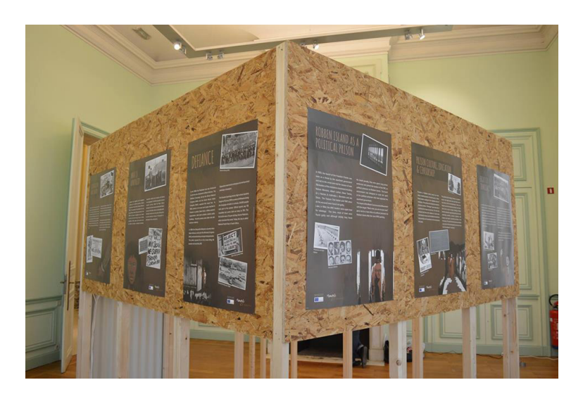
Figure 5 Mandela27 at the BELvue Museum, Brussels 2014.

Visitor to the pop-up installation, BELvue Museum, Brussels 2014.<sup>17</sup>