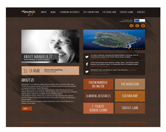
Figure 7 Digital platform created by TCS as part of the Mandela 27 project 2014.

When the installation started touring in 2014, bandwidth and access to individual digital devices were limited, especially in less affluent communities. To overcome this challenge, most venues presented the Mandela27 game as a video. This enabled visitors to view the game without the need to possess a smart mobile phone or tablet. We also found that playing the digital game slowed visitors' movement and caused bottlenecks, until we converted it into a video. Having designed the DIY installation to work without the benefit of institutional space, we recommend that the flow of visitors for such exhibitions should be planned in advance.