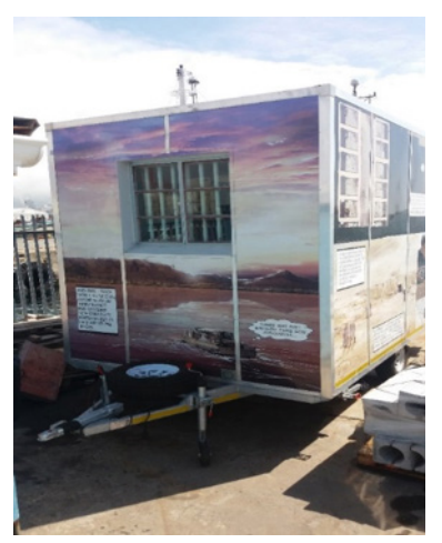
Figure 4 Beyond Mandela 27 Mobile Cell.

The overwhelmingly positive response to Mandela27 in South Africa prompted the Robben Island Public Heritage Department to find ways of continuing the project, which subsequently morphed into Beyond Mandela27 — a mobile exhibition with a more robust version of the travelling cell (Figure 4). The aim was to ensure that the mobile cell reached young people, especially those from impoverished rural areas without the means to visit Robben Island Museum. Between 2017 and 2019, the Beyond Mandela27 concept was integrated into Robben Island Museum's Outreach Programme, which visited all nine South African provinces, including community centres and schools, prior to the outbreak of the COVID-19 pandemic.