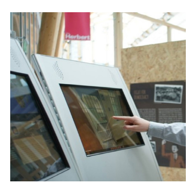
Figure 3 Mandela27 at The Herbert Art Gallery and Museum, Coventry 2014.

To narrate the history of apartheid and the role culture played in promoting democratic change, nine illustrative posters were designed by South African students. The posters and the project notes, which offered guidance for teachers, cross-referenced the political unrest in South Africa with European events, such as the rise of Solidarity in Poland and the fall of the Berlin Wall, which also led to increased equality and democracy. As reported back to the team by teachers who engaged with the installations, the teacher notes were considered to be one of the project's most important assets to facilitate learning.