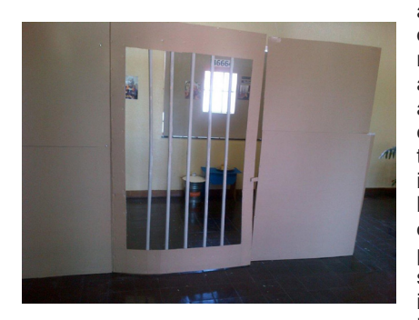
Figure 10 A cardboard version of the Mandela27 pop-up installation at The Manenberg Community Library, South Africa 2015.

Mandela27. We argue that communities' involvement in making their own versions of the cell, by deciding which assets to use and how to use them, could be described as participation at