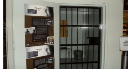
Figure 8 Mandela27 Mobile Cell donated by the Cape Town Department of Home Affairs to Robben Island Museum 2017.

With our project, we wanted to engage people in how the history of political change affected cultural relations. Of course, any recent political struggle can be a touchstone for the anger and high emotions of a nation. Apartheid is a particularly sensitive and emotive subject to discuss with communities in South Africa, which was reflected in the physical and digital objects of the installation. In Europe, the political regime of apartheid was more of a distant issue, but there was common ground to be explored in the project, specifically around the discourse of racism and suppression of freedom – topics which are common to all countries and nationalities. Mandela, with his reputation for non-violent protest combined with his success in establishing democracy and freedom in South Africa after 27 years of imprisonment, was the ideal figure to form a bridge between the two regions of Europe and South Africa.