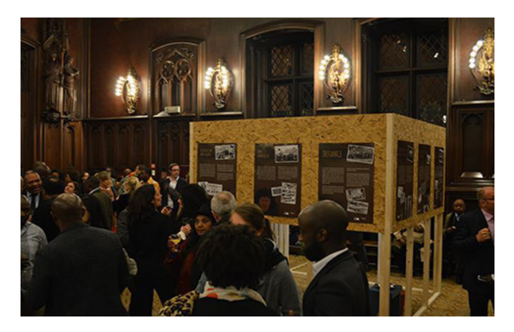
Figure 1: Mandala27 at Brussels City Hall for the International Day for the Elimination of Racial Discrimination, 2014.

telling the story of the country's journey from apartheid to reconciliation.