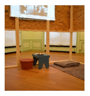
Figure 9 Mandela 27 inside BELvue Museum 2015.

This example illustrates how the visitors of Mandela27 received active knowledge of the oppression under apartheid, capable of transforming them through what Felman and Laub (1992) describe as 'a crisis of witnessing'. In a similar way to Felman and Laub, whose teaching about the Holocaust transformed their students, teachers used the resources of Mandela27