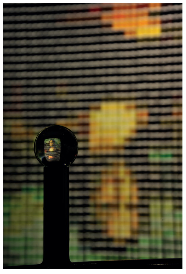
Fig. 2 After the Mona Lisa 8 by artist Devorah Sperber.

brain take care of different tasks. Sperber's art installation After the Mona Lisa 8 was placed in the section 'Your sensing brain', next to other examples of how we see and interpret the world around us. At first sight (and especially at a distance) Sperber's piece looks like a colourful arrangement of large spools of thread on the wall. When peeking through a small spherical lens in front of it, however, the arrangement of spools appears as a pixelated rendition of the painting Mona Lisa (Fig. 2).