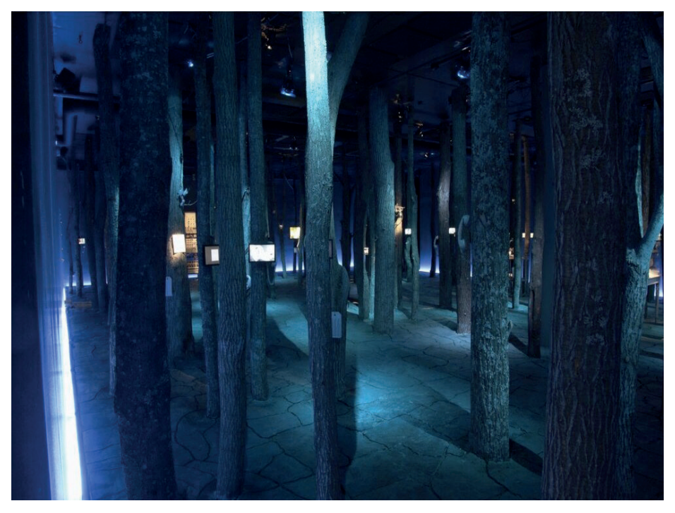
Fig. 7 View from the entrance to the 'Forest Room'.