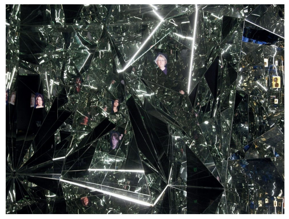
Fig. 5 Faces in the 'Mirror Room'.