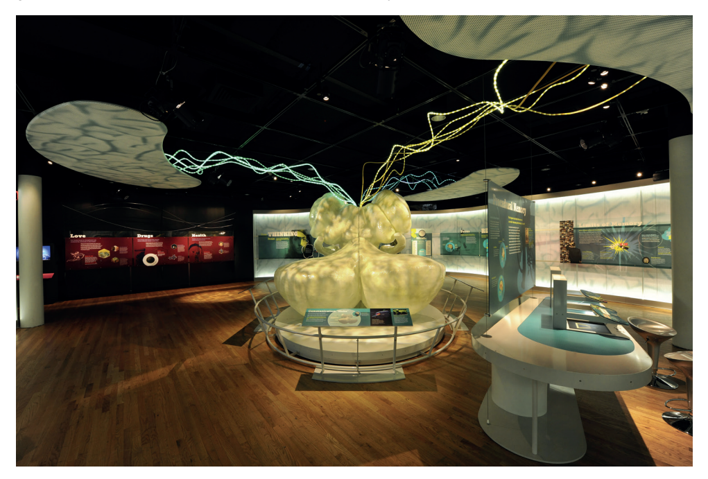
Fig. 4 View from the entrance to the section 'Your Thinking Brain'.

other picture – of frying bacon. One the one hand, this felt like a surprising and stunning way of communicating that how we interpret sound is very much dependent on visual input. On the other hand, this exhibit can also be seen as an example of how our attention, gaze and movements were strictly directed and clearly choreographed throughout – making sure we got all the facts about 'how the brain works' or 'why it matters'.