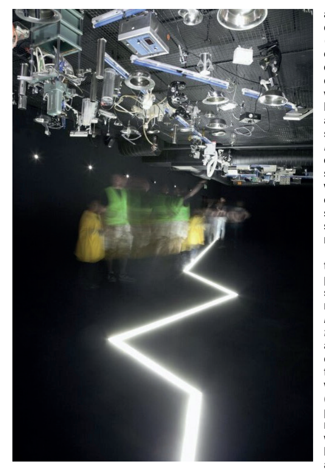
Fig. 8 Guided group of children walks along the light tubes in the 'Lighting Room'.