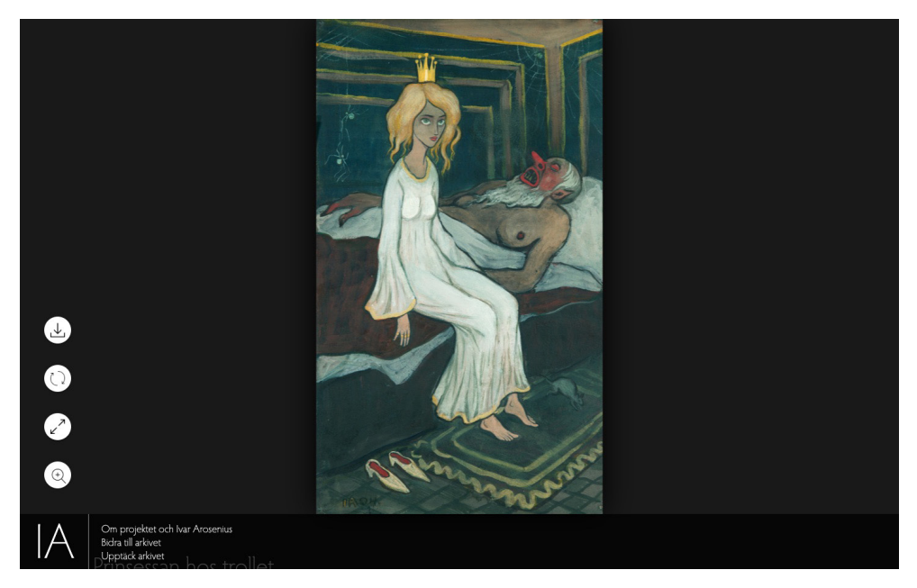
Figure 2. Single picture chosen from the initial screen