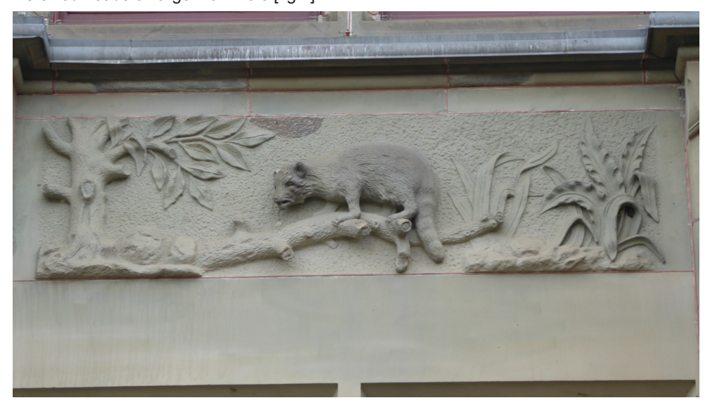
Fig. 1: Racoon, Canadian Museum of Nature, Ottawa.

To read the Victoria Memorial Museum as a natural history museum is again a distortion of its actual role, projecting its current iteration as the Canadian Museum of Nature onto a building that was designed to house a national museum, with collections representing human as well as natural history. As at Trinity, the museum's decorative schema contributes to this illusion. The Victoria Memorial Museum was built to be a mixed museum, yet its decoration is almost entirely natural historical. On the exterior walls of the museum it combines low-relief scenes depicting animals inhabiting their environments [fig 1] with more massive, approximately life-sized heads of large mammals [fig 2].