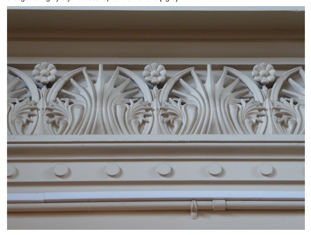
Fig. 5: Frieze, Redpath Museum, Montreal. Author's photograph.

Yet if the Redpath does not express natural theology directly, its architecture must at least have been felt by Dawson to be compatible with it. The oval ceiling of the museum's main hall, ringed with daylight; the serene regularity and smooth rounded lines of the woodwork; the temple façade – these could all be seen to match a benign, orderly view of nature. Of course, this is little more than an impression. There is, however, one specific detail of the decoration that hints at Dawson's own contribution to natural history and his anti-evolutionary science. A frieze around the upper gallery incorporates what appear to be sea squirts or ascidians alongside highly stylized scallop or clam shells [fig 5].