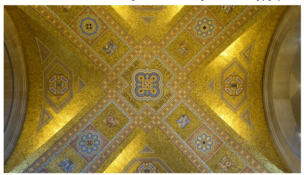
Fig. 6: Mosaic ceiling, atrium, Royal Ontario Museum, Toronto.

The decorative detail through which the Royal Ontario Museum proclaims its loyalty to natural theology is far less self-effacing. From 1933, the main entrance to the museum welcomed visitors into a rotunda with a golden mosaic arching across its ceiling [fig 6].