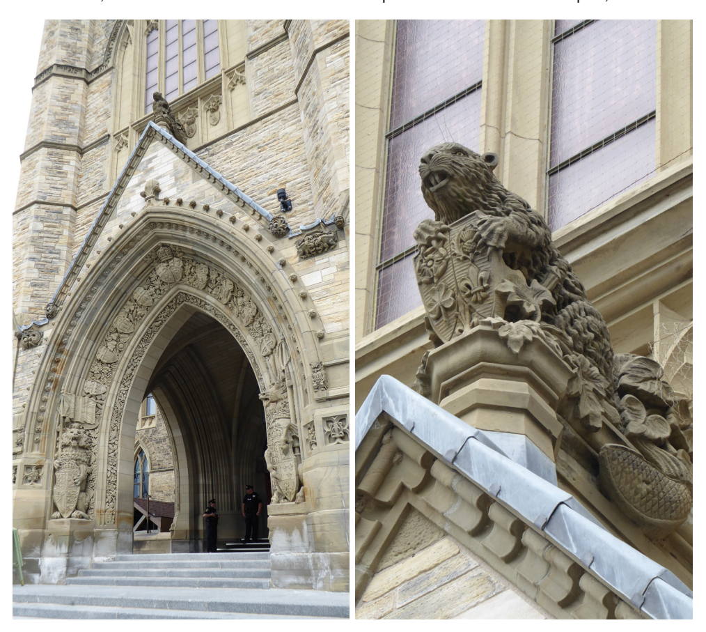
Figs 3 and 4: Main entrance and detail, Parliament Building, Ottawa.

What that statement was only becomes clear when the museum is put back into the history and geography of Canada's capital city. The museum was built at the south end of two large boulevards, Metcalfe and Elgin Streets. At the north end stood the Parliament. The two sites offer competing architectural symbols of Canada, built in different styles with different symbolism. The three main blocks of the Canadian Parliament, together with its Library, were all in a Gothic style. The Scottish Baronial style adopted by the Chief Dominion Architect David Ewart for several public buildings in Ottawa in the early twentieth century, including the Royal Mint and the Connaught Building as well as the museum, may seem merely a variation on a medieval theme, but its implications were quite different. Neo-Gothic was very much an English style, identified with the Houses of Parliament and the Church of England. Through its architecture, the Canadian Parliament affirmed its place within the British Empire, centred on