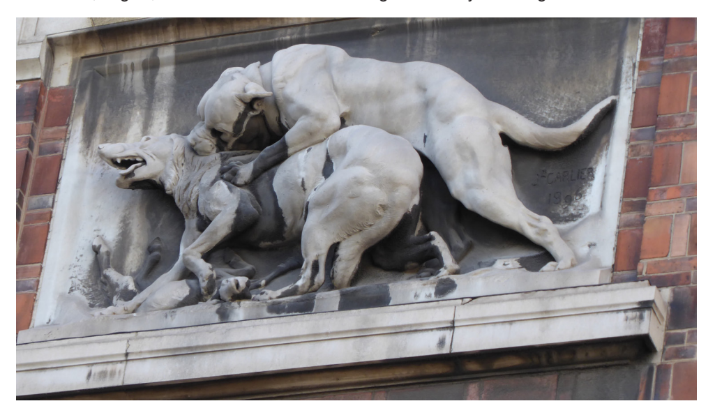
Fig. 7: Relief sculpture, Galeries d'Anatomie comparée et de Paléontologie, Paris.

These same tensions between national prestige and universal truth, between symbolic and realistic modes of representation, between science as fact and science as myth, are played out once more in the architecture of the anatomy and palaeontology galleries of the Muséum national d'Histoire naturelle, opened in the Jardin des Plantes in Paris in 1898. As at Oxford and in Vienna, the schema combines natural history with allegory and portraiture, in this case to represent something that looks like a Darwinian vision of nature, shot through with violence as sculptures show animals goring and mauling one another [fig 7] and men grappling heroically with bears, eagles, horses and crocodiles or being throttled by an orang-utan.