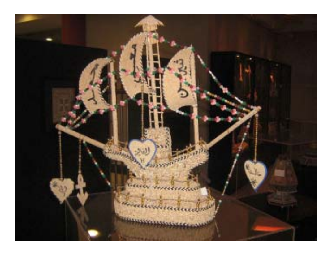
Photo No. 6 A replica of the 'ship of return'. Made by a Palestinian prisoner and exhibited in the Abu Jihad Museum in Abu Dis.

'terrorism,' highlighting the way in which even such use of the inverted commas is a political act.