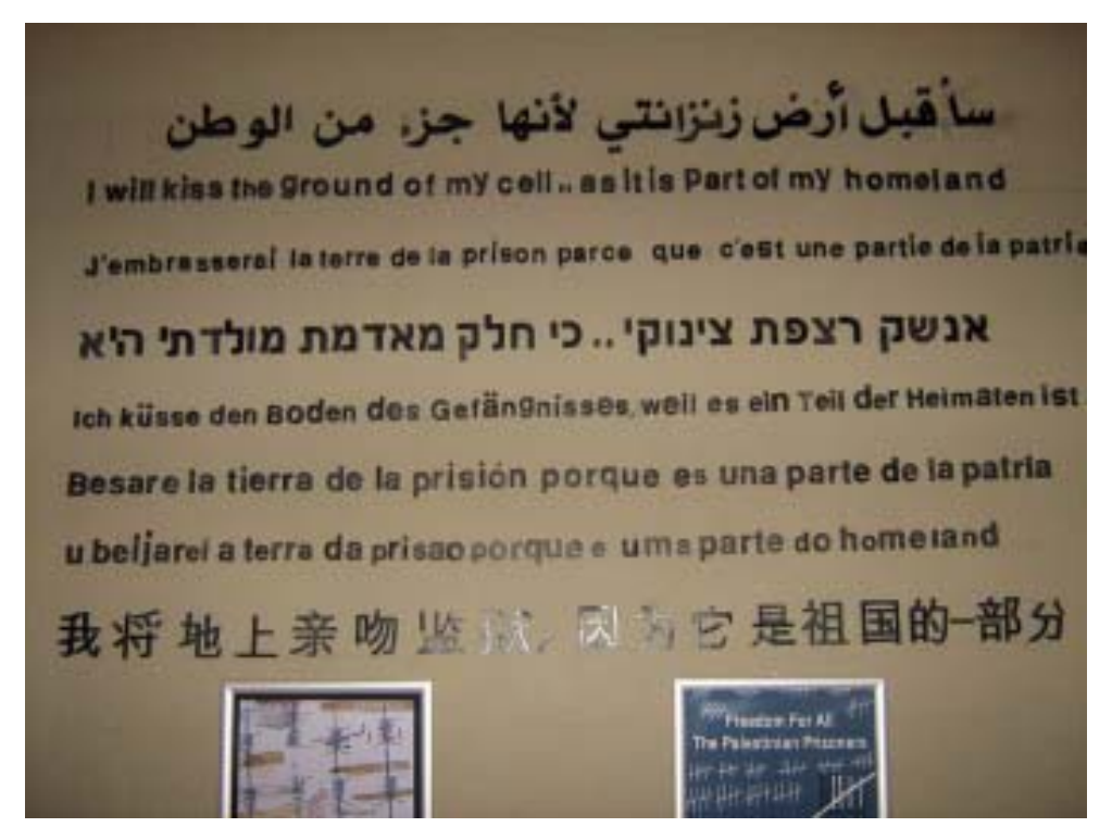
Photo No. 3 An eight-language exhibition wall in the Abu Jihad Museum, Abu Dis.

in the name of the Center, its website, and the many references to this word in the Center's official goals, is purposive. As we see it, there is a strong rhetorical element to this repetition, which is supposed to create both fear and certainty among the visitors – physical or online – of the existence and prominence of 'terrorism' within the Palestinian society, strategy and politics. This perception corresponds with prevailing political views among Israeli-Jewish society and establishment.<sup>9</sup>