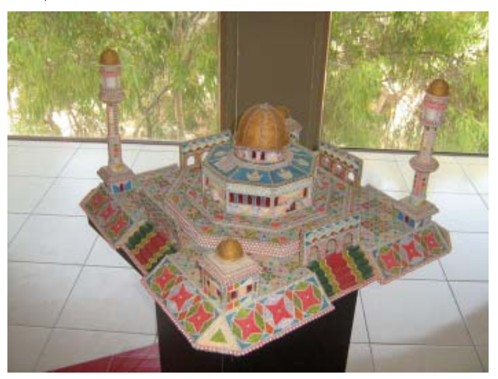
Photo No. 1 Model of the Dome of the Rock, made by a Palestinian prisoner in one of the Israeli jails. Exhibited in Abu Jihad Museum, Abu Dis. Photo taken from the official website.

defend their politics. The Palestinian museum, the Abu Jihad Center, has focused on the issue of the nearly 7,000 Palestinian prisoners currently held in Israeli prisons and detention centers, and also, more generally, on the history of the Palestinian Prisoners' Movement. It examines the suffering of the Palestinian prisoners, the political implications of their capture, their role as 'resistors,' and the violations of their rights at the hands of the Israeli authorities. In this way, the Palestinian curators have attempted to re-appropriate the traditional idea of the 'museum' and to utilize it as a localized form of public expression held in contrast to Israeli claims and narrative (Ames 1992: 13).<sup>2</sup> The Israeli exhibition space, meanwhile, has focused on the Israeli understanding of 'terrorism' – and uses its museological space, and many documents, movies, and exhibits, to justify Israeli actions and to depict them as defensive in nature. Israelis are portrayed as acting against a Palestinian offensive armed struggle instigated to hurt the Israeli people (hence the self-perpetuated perception of themselves as victims).