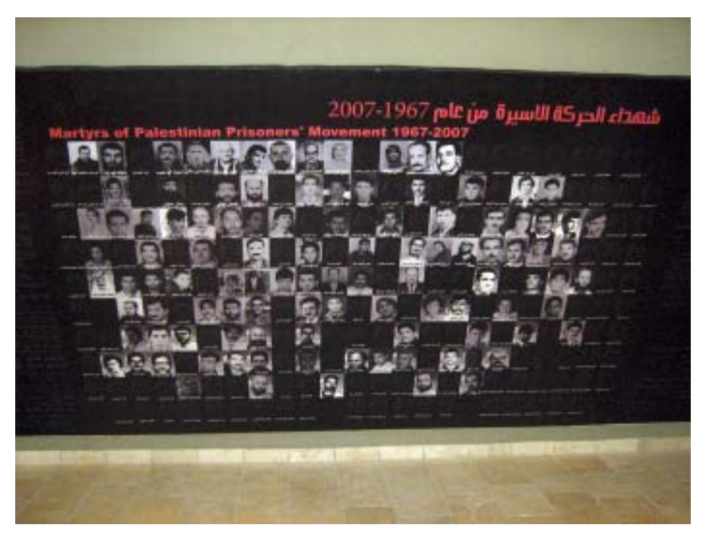
Photo No. 2 The Martyrs' Wall, Abu Jihad Museum, Abu Dis.

Both museums use specific national and political perspectives and experiences to depict what are very often the same events. The two museological sites use the elision and sometimes the outright suppression of facts, as well as particular emphases within their displays and text to leave visitors with specific political impressions. That museums have an ideological bent is hardly unusual, but rarely are there two opposing ideologies displayed in two equivalent-sized and funded institutions in such close proximity to one another. Beyond their geographic proximity, their twinned emphasis on (relatively) current events means that many of the visitors to these exhibits are able to frame the exhibition's ideologies using their own recollections of the events and to bolster their ongoing political conversations with others using 'facts' from the museums.