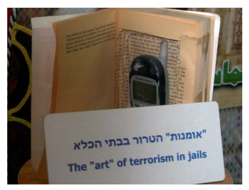
Photo No. 7 A notebook of a Palestinian prisoner with a hiding place for a mobile phone. Exhibited in the Israeli Intelligence and Terrorism Information Center.

'Abu Jihad Museum's library is the most important part of the museum... and it includes a computer hall, through which the visitor can obtain any information concerning prisoners...' (emphasis added). 15 That the library is referenced as 'the most important part' shows the value the Palestinian Center staff attributes to the library as a reservoir of knowledge, which can both give the museum an informative, scientific, academic 'authorization,' and can encourage researchers to conduct studies about and to receive information from the museum and its library.