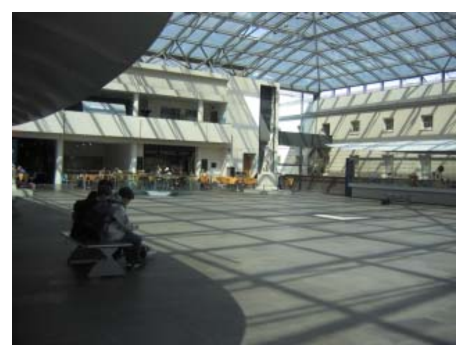
Figure 11 Civic space within the National Maritime Museum.