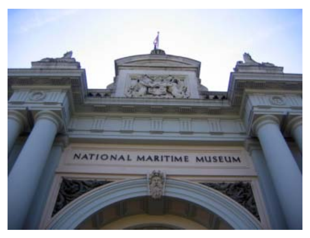
Figure 10 Entrance to the National Maritime Museum.

process of enactment of the museum's 'script' (Duncan and Wallach 1980: 450-451), it uses their analysis of the making of citizens in the art museum as a formula for understanding how another type of museum might constitute another political identity: the human subject protected by human rights.