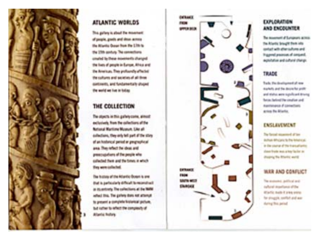
Figure 9 'Gallery Guide' Atlantic Worlds The National Maritime Museum.

however, dominates its main spaces. The halls initially encountered by visitors contain large-scale, interactive, technological exhibits and uses the language of discovery associated with science museums: visitors are encouraged to discover the extraordinary world that has been discovered by inventors or explorers. Not all the spaces within the National Maritime Museum are the same. In many if not almost all museums, galleries undergo re-development and redisplay at different times according to political and financial priorities to produce a rather inconsistent overall effect. Each museum space, shaped by the curatorial principles current when it was created, differs in form and content. For example, the Ships of War gallery in the