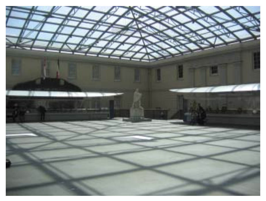
Figure 12 Upper Deck collection.