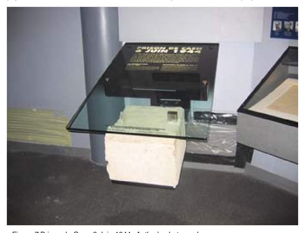
Figure 7 Prison de Caen 6 Juin 1944.

Arbitrary arrest, detention, discriminatory legislation and complicity with the already established abuses of the fascist state pile up as evidence against the Vichy regime and those named as the engineers of collaboration. At this closing stage of the gallery, museum visitors are addressed as history's jury; they are invited to adjudicate upon the wrongs of the past from their position in a better present. Retrospective views suppose some degree of separation. There is a difference in time between the moment when events recorded in the museum took place and that when its visitors have come to re-examine them. Visitors finally inhabit their more customary role within the museum: they become observers. They have felt the effects of past and are now enabled to judge the actions of historical figures. They have a dual relationship to the past or, rather, two different relationships to the people of the past: a close, physical connection to the victims of war and a dispassionate one to its perpetrators.