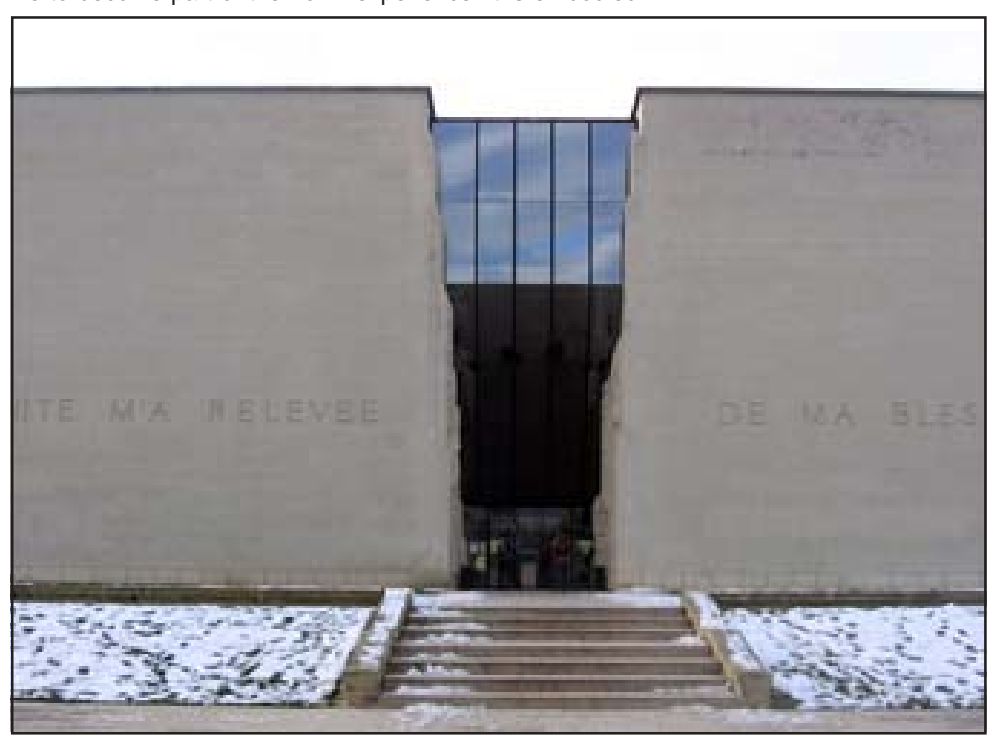
Figure 2 Le Mémorial de Caen. Designed by Jacques Millet.

Twentieth-century war, and especially the Second World War in Europe, must be the most widely known history of all. It is a staple subject of the film industry; it is a fixture of school curriculums; it is always a focus of academic enquiry and popular writing. The visitor to Le Mémorial de Caen could have read about the Nazi occupation in countless books or viewed numerous films without leaving the comfort or his or her home. Visiting this museum (or, indeed, any other) is not a simple quest for information. It demands greater physical effort than either reading or watching; it involves the whole body in motion. Visiting a museum is a journey. In the case of Le Mémorial de Caen , close to the Normandy beaches, the journey could be considered a type of pilgrimage to a sacred landscape, which is completed inside the museum. Thus, the history exhibited within its walls, whether or not its outline or its details are already known, is assimilated into the journey of the visitor, absorbed into a day of their life to become part of their own experience: it is embodied.