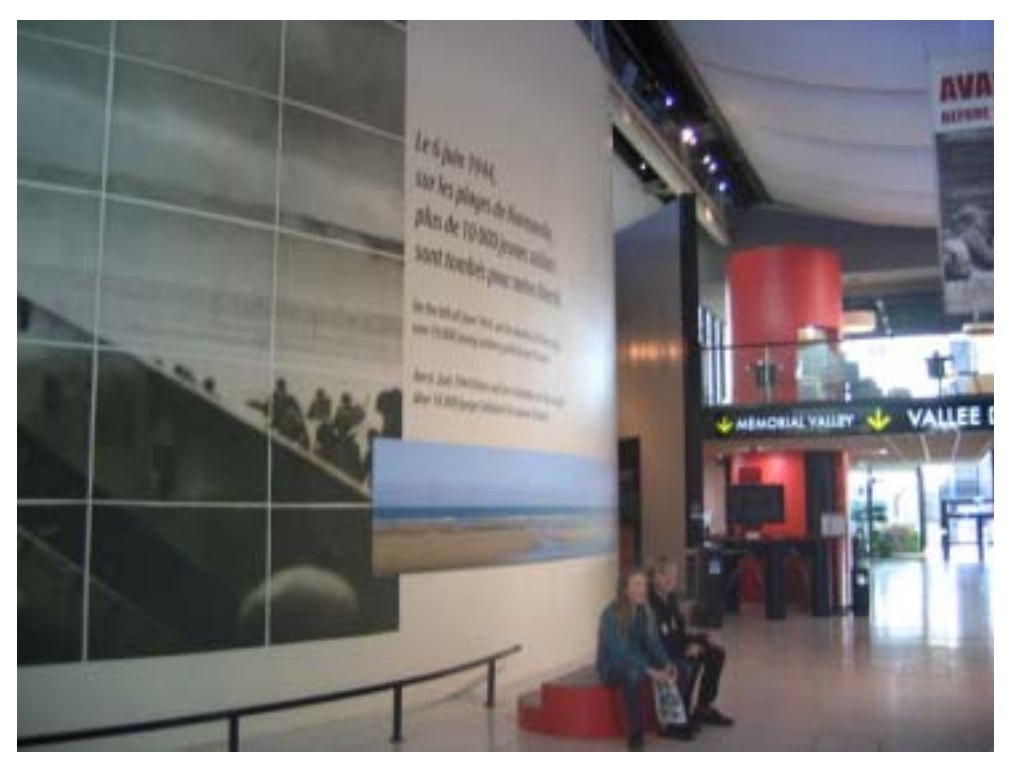
Figure 4 Inside Le Mémorial de Caen. Gallery designer: Yves Devraine.

elicit the solemn attitude associated with honouring war dead at funerals and public commemorations: a slowed walking pace that keeps the bustle of life at bay and a hushed, dutiful silence which permits some recognition of absence.