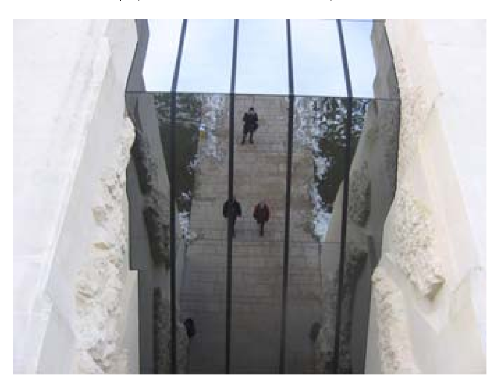
Figure 3 Entrance to Le Mémorial de Caen. Designed by Jacques Millet.

Healing the broken body, or to put it in a less visceral or literary way, overcoming disunity that is both a cause and effect of war, is a fundamental principle of the museum. The Guide to Le Mémorial describes its 'running theme' as 'universal reconciliation' ( Le Mémorial de Caen 2008: 4). This can be seen in its educational activities but also, importantly, it is embedded in the 'museum itself'. The transformation from the disruption of war into an ideal of unity structures the narrative of the museum and the journey of the visitor through it; it is 'written into the architectural script' (Duncan and Wallach 1980: 450-451).