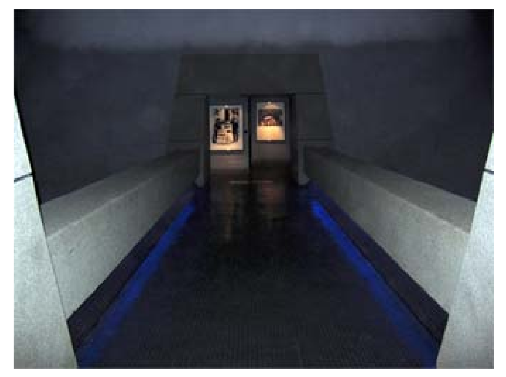
Figure 6 Bridge to La France des Années Noires/France in the Dark Years. Gallery designer: Yves Devraine.

rooms without natural light. Le Mémorial's Guide describes it as a 'deliberating oppressing, confined space' (Le Mémorial de Caen 2008: 13). Historical interpretation is again manifested in the museum's architecture, which in turn provides the coordinates for the visitor's experience through four chronological sections: the Phoney War, Defeat and the Armistice, Occupation and Collaboration, Resistance and Repression. A chronological order and sense of direction is lost in the last section as visitors are left to select exhibits for closer inspection. Some are accounts of collaboration, others of resistance. Hesitancy within museum spaces is a common experience. Unsure that they have understood what there is to see, visitors may ask themselves or each other: what shall we do now? The uncertainty of visitors in the final stages of La France des Années Noires/France in the Dark Years is an echo, albeit without urgency of a call to action, of the dilemma of the French people under occupation. Historical problems are felt, translated into the uneasy movements of the body of the visitor in the museum.