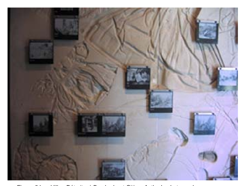
Figure 8 Les Villes Détruites/ Bombed out Cities.