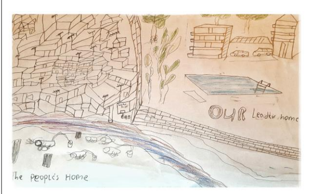
Participant A's illustration of the divide existing between theirs and their leader's lifestyles

group discussion and thereafter a co-design workshop in two of the Community Social Halls, Kosovo and Mlango Kubwa, respectively within Mathare Valley, in June 2021. The number of project participants was restricted to 11 due to Covid-19 circumstances, with 9 participants completing both workshops. These participants (7 male, 2 female) were between the ages of 22 and 24 years old, and all reported being born in Kenya. Recruited by the local team in collaboration with community gatekeepers, about half of the participants have been described, in the project debrief, as having experience with media like graffiti, whilst the others had some background of political activism (efforts towards bringing social and political change through door-to-door campaigns and social interactions in meetings led by the community elders and leaders commonly known as Barazass ). During the initial focus group session, Amulyoto introduced political cartooning as a tool for targeted messaging. The co-design workshop consisted of a practical drawing session and an oral presentation, with participant drawings being finalised by Amulyoto for dissemination (Figure 2).