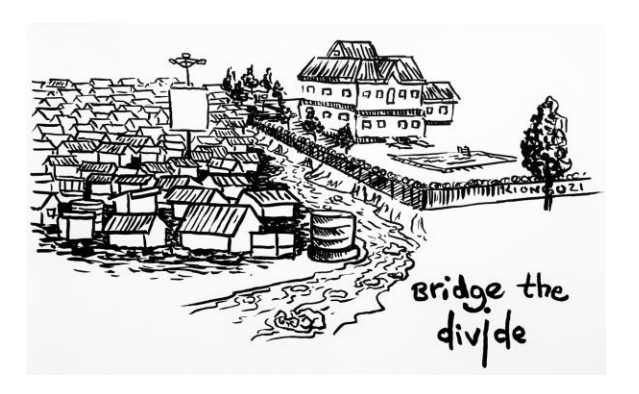
The research teams' adaptation of the participant A's illustration on the left