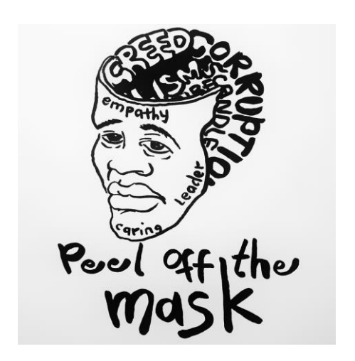
The research teams' adaptation of the Participant B's illustration on the left