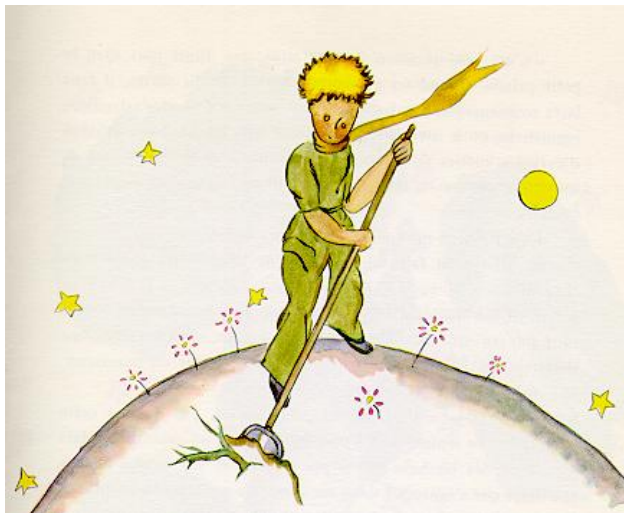
Figure 1 – The Little Prince on his planet [2]

The Little Prince is a 1943 novella in which the narrator, an aviator, encounters a young prince fallen to Earth from another planet. As the narrator gets to know the Little Prince, he learns that the Prince's planet was so small that one day he saw the sunset "forty-four times", and all he had to do was to move his chair "a few steps" [1].