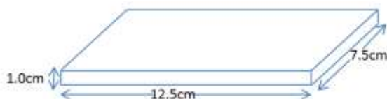
Figure 4: Dimensions of a Pop-Tart