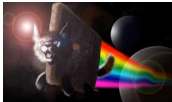
Figure 2: An artistic representation of Nyan Cat [3] .

This model was altered; as after more research was conducted it was discovered that Nyan Cat was in fact just one thin Pop-Tart as can be seen in Figure 2. Therefore the model was altered to take this into consideration.