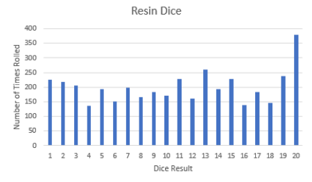
Figure 2 – A graph showing the results from the rolling of the Resin D20.

the unbalance in both dice is statistically significant enough to not be just due to chance; the dice do not roll evenly.