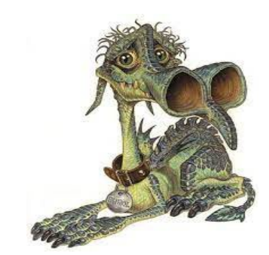
Figure 1 – Errol the Swamp dragon. The pet of Lady Sybil [5] (Original artist: Paul Kidby).

Hence, I will look at different ways the body of the dragon could cause it to explode like the mixing of chemicals in the stomach and spontaneous human