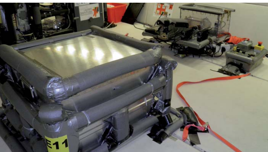
Getting down to work: Setting up and monitoring the rig during the parabolic flight

Unbelievably, the aircraft had developed a technical problem and there would be no flight that day. By now there were just two days left of the campaign, with one team mate who had flown leaving before the last day and another already flying home for her