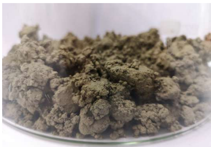
Fe - rich industrial waste called Jarosite; containing Fe, Ni, Co, In, Ge, Pb, Zn.