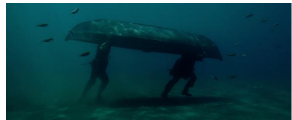
Figure 1: A frame from Pirates of the Caribbean: The Curse of the Black Pearl showing the two pirates with their homemade submersible.

The gases inside the boat that are relevant are oxygen, which the pirates need to breath, and carbon dioxide, which can be harmful if inhaled in large quantities. Composition of air that is breathed in is made up of around 21% oxygen and 0.04% carbon dioxide, the air that is breathed out is composed of 16% oxygen and 4% carbon dioxide [3]. The remaining 1.04% is water vapour. Therefore 3.96% of the air in each breath is converted from oxygen to