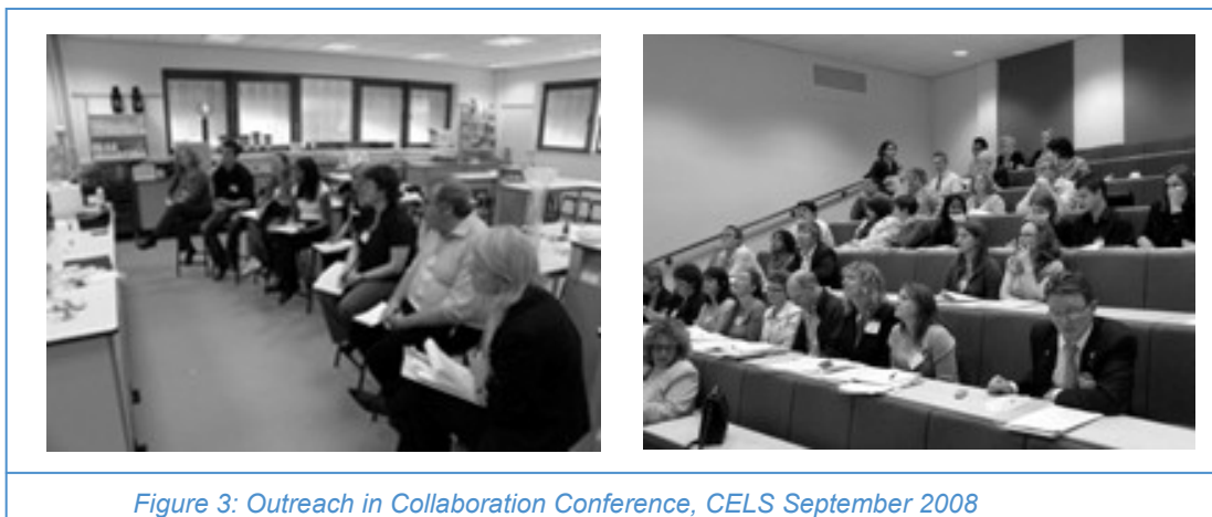
Figure 3: Outreach in Collaboration Conference, CELS September 2008

Other examples of collaborative working and dissemination are: