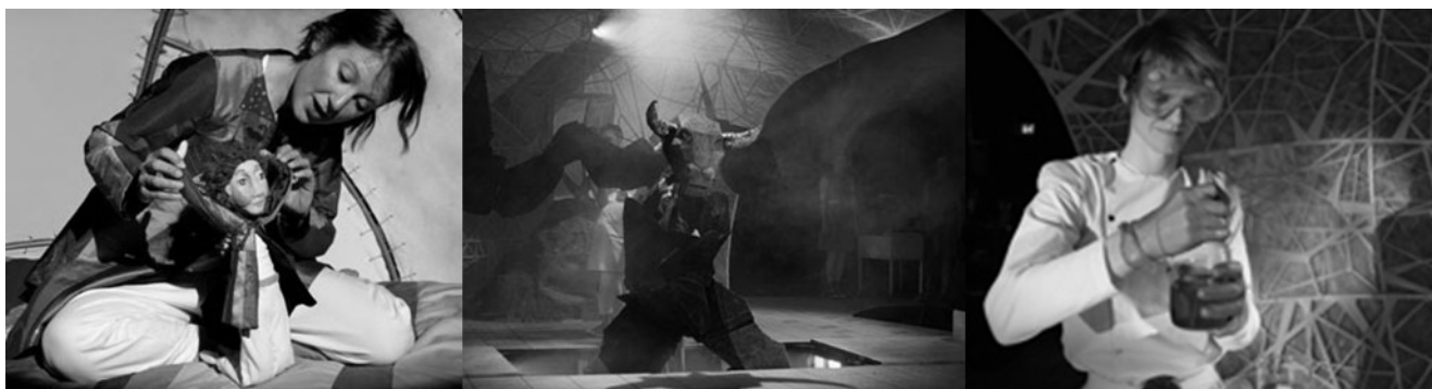
Figure 2 Pictures from Icarus and Cosmos productions