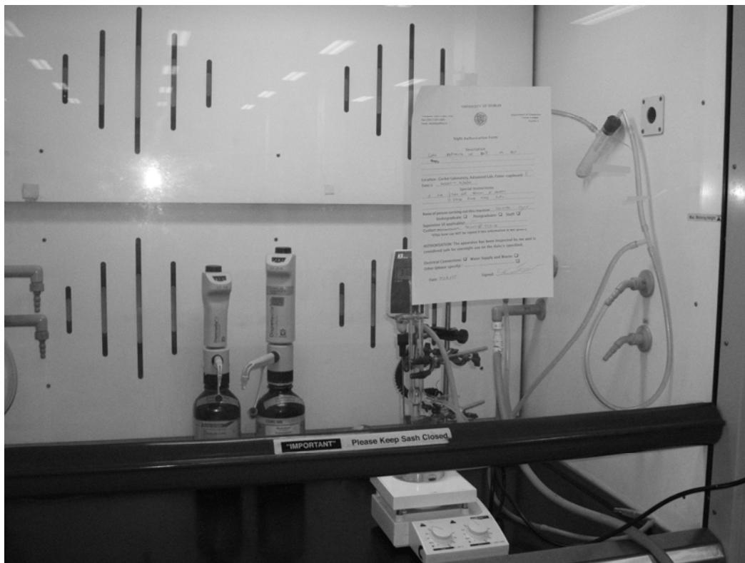
Figure 3: Scavenger hunt setup for reflux apparatus

The implementation of the workshop with third year students has also allowed us to invite our final (fourth) year project students to join in our postgraduate safety training day, run jointly with the School of Biochemistry and Immunology at the beginning of each academic year. The impact of doing so was