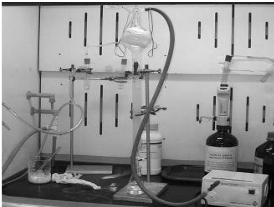
Figure 2: Scavenger hunt setup for column apparatus

The feedback we received from our undergraduate students was extremely positive, with most students commenting that their level of safety awareness had improved as a result of the safety workshop. The lab scavenger hunt was found to be one of the highlights of the day, with students noting they benefited from critically reviewing apparatus setups and would begin to do so with their own experimental setups. The team-building aspect of the exercise proved successful with some students remarking on the fact that they got to know their classmates