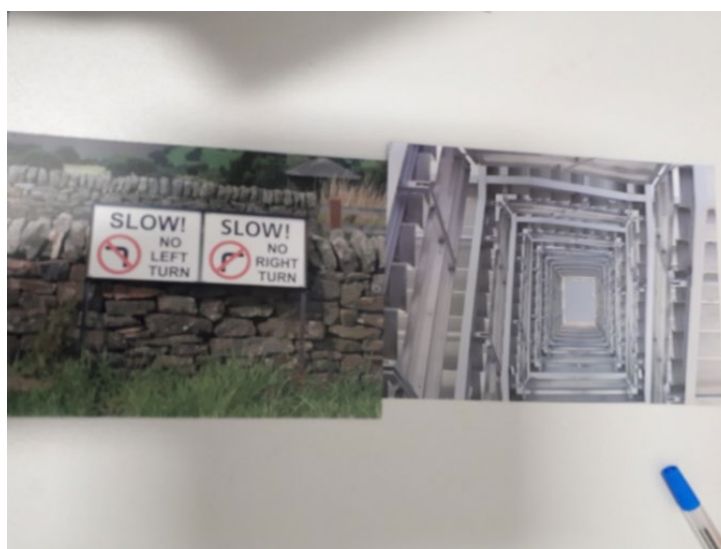
Figure 1 Evoke cards chosen to illustrate the crowded, concrete busy town campus