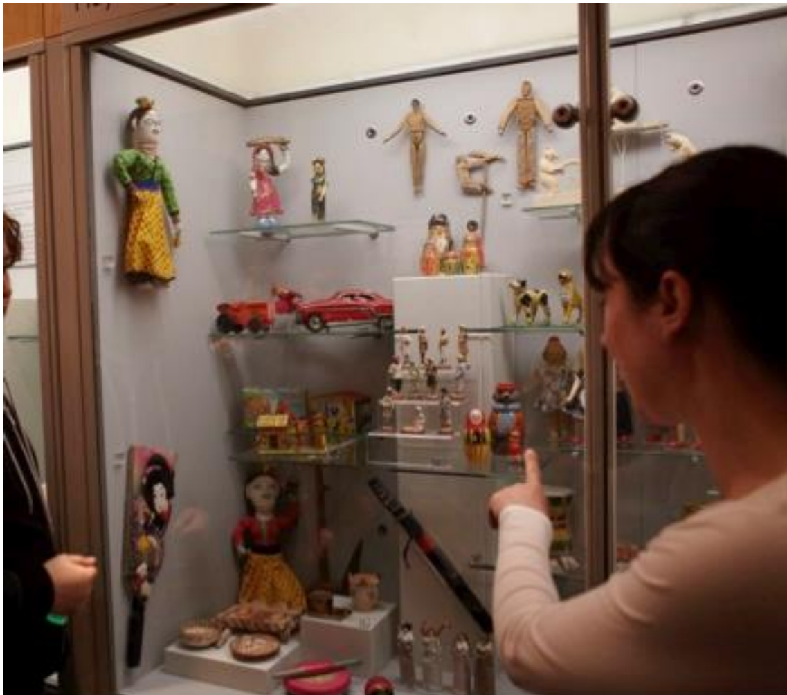
Figure 2 - Body, Mind, Spirit Workshop at New Walk Museum & Art Gallery.