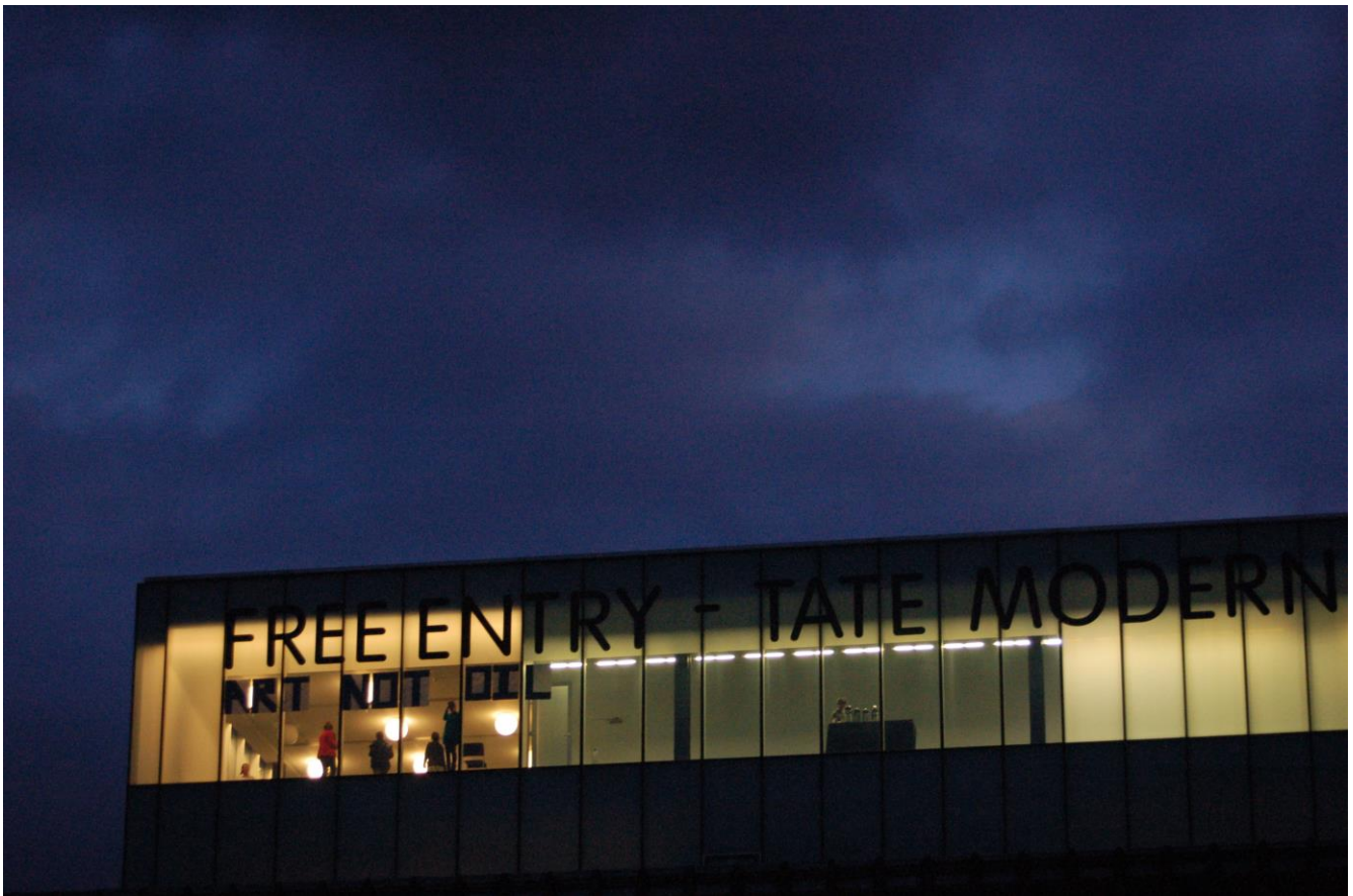
Figure 1 - Liberate Tate established, 2010.