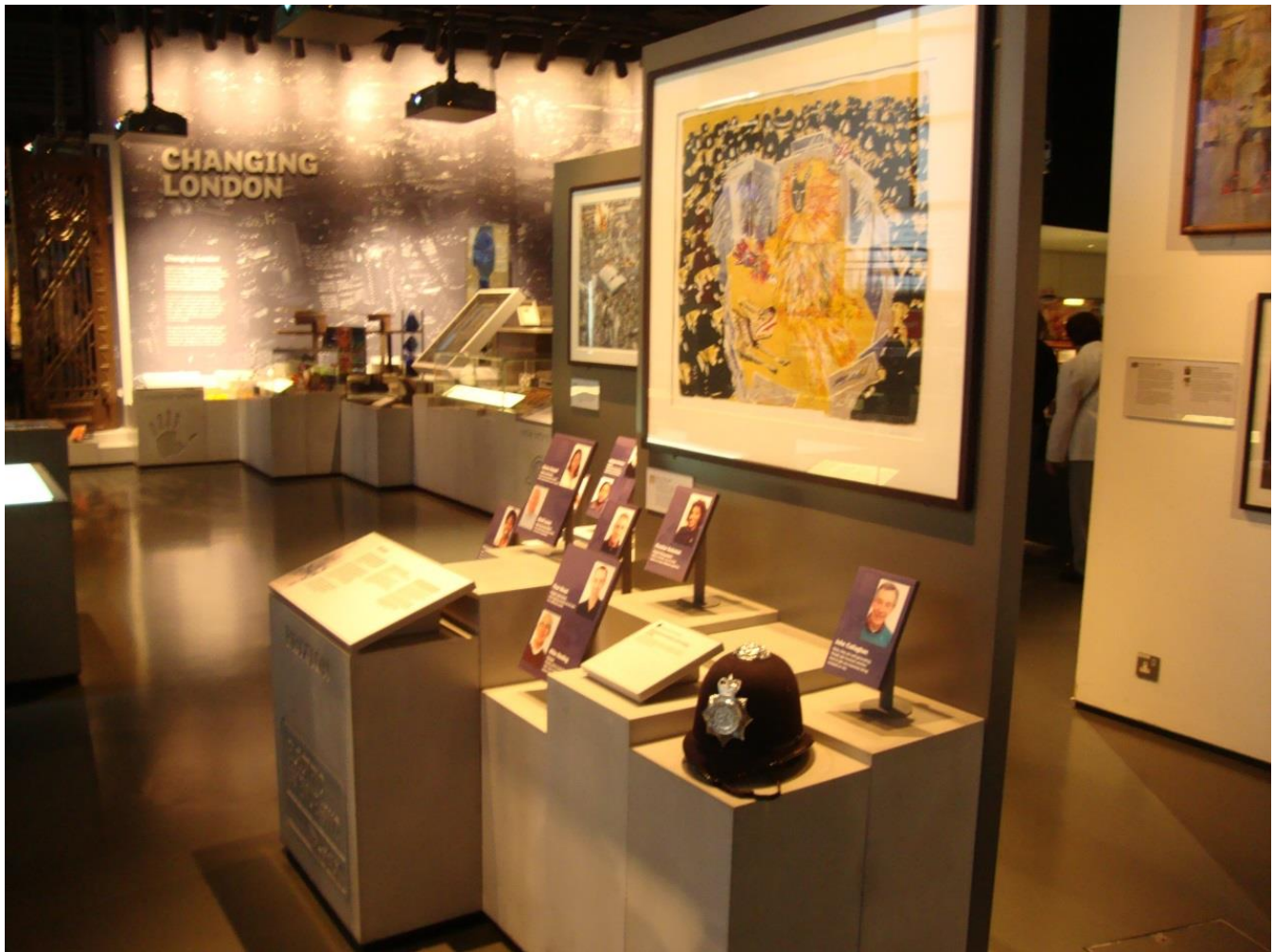
Figure 4 – Part of the World City gallery, showing the Brixton riot display.

accommodated and the museum would have included a relatively high-profile civic engagement project, and engaging oral histories of what it was like during the time of the riots.