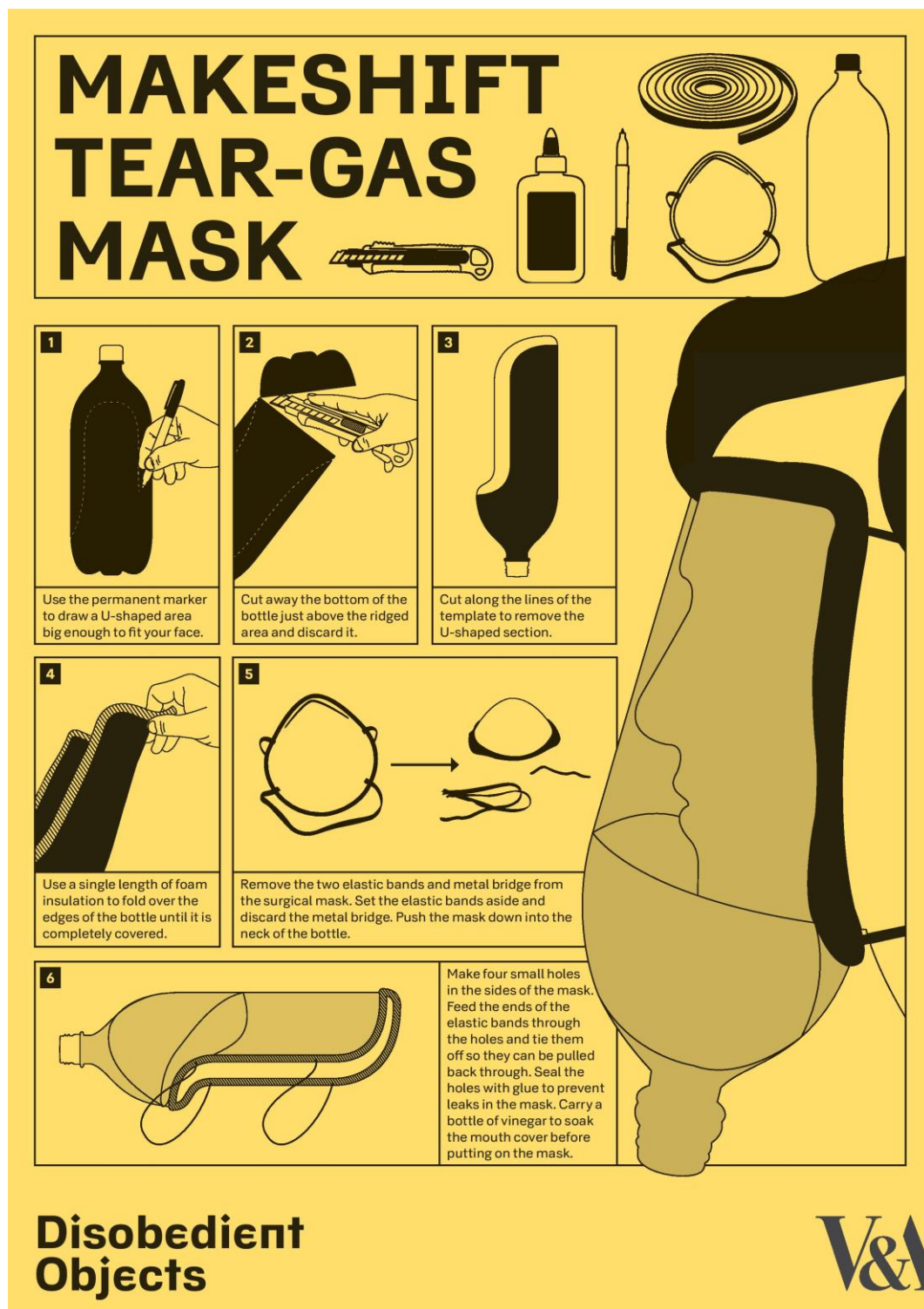
Figure 4 - How to Guide- Makeshift Tear-Gas Mask. Illustrated by Marwan Kaabour, at Barnbrook - www.vam.ac.uk

Hong Kong. Documentary footage showed that participants had used the V&A's 'how to' guides to construct teargas masks during the demonstrations (Figure 4).