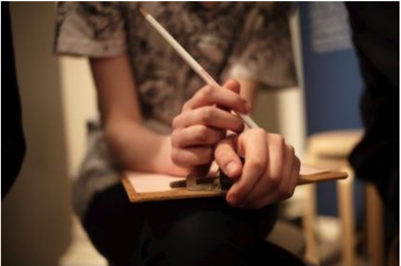
Figure 1 - Body, Mind, Spirit Workshop at New Walk Museum & Art Gallery.

Staff and pupils work across these three bases or school sites as well as on outreach in pupils' homes. The length of time students are with the hospital school varies from a few days at the Leicester Royal Infirmary and Oakham House, to over a year at the Willow Bank Day School and on outreach. Often students move through different parts of the school as dictated by their health and other circumstances. At the Leicester Royal Infirmary and at Oakham House, pupils are taught as they are admitted, depending on the state of their health and emotional wellbeing. The Leicester Royal Infirmary team will pick up students after five days, and at Oakham House, students attend school as soon as possible after admission, if they are deemed well enough to do so. There are 33 Teaching and Support staff working across all parts of the school. The Body, Mind, Spirit project worked specifically with pupils and staff at Willow Bank School. These students are unable to access their own schools for both medical and psychological reasons. Each student has his or her own personalised timetable which incorporates core and foundation subjects, as well as a focus on the arts and a therapeutic curriculum built around individual needs (7).