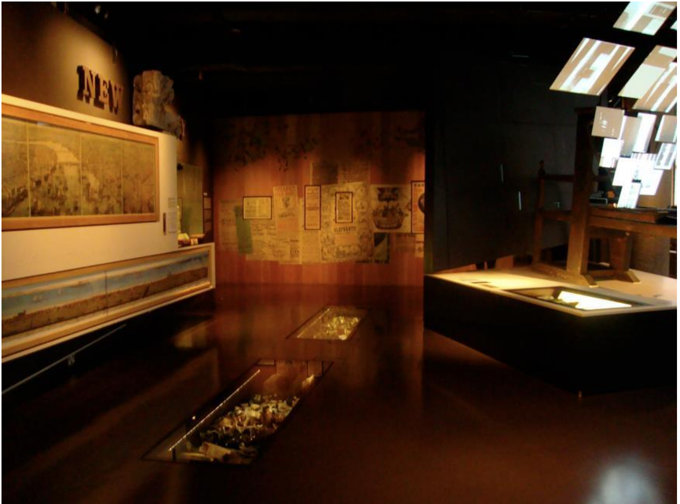
Figure 1 – Expanding City , with the underfloor cases.

designed the underfloor cases with objects from the London Archaeological Archive Resource Centre (LAARC). The process involved meetings with curators to learn about the galleries as a whole, being given a tour of the LAARC stores and meetings with designers. The group then selected and arranged objects, creating layouts in a process reflecting that undertaken by the curators and project assistants employed by the museum. These layouts were then photographed, and the objects were prepared for installation.