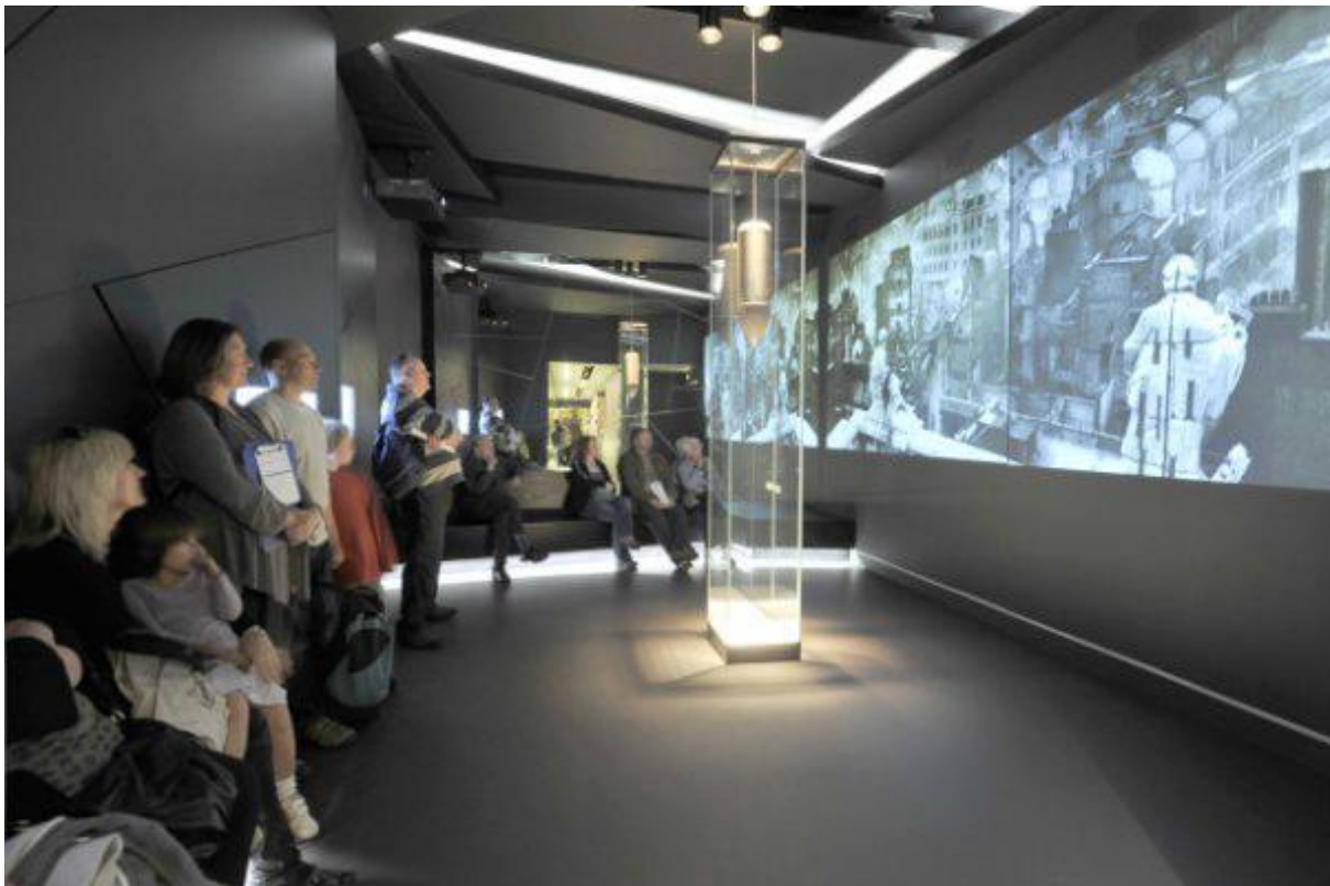
Figure 3 – Part of the People's City gallery, showing the Blitz installation.

Moving through the galleries, the next case study looks at how the museum represented the ways that London's inhabitants experienced the Second World War. Using individuals' stories, the museum exhibits some of the effects of the conflict onto the city's population.