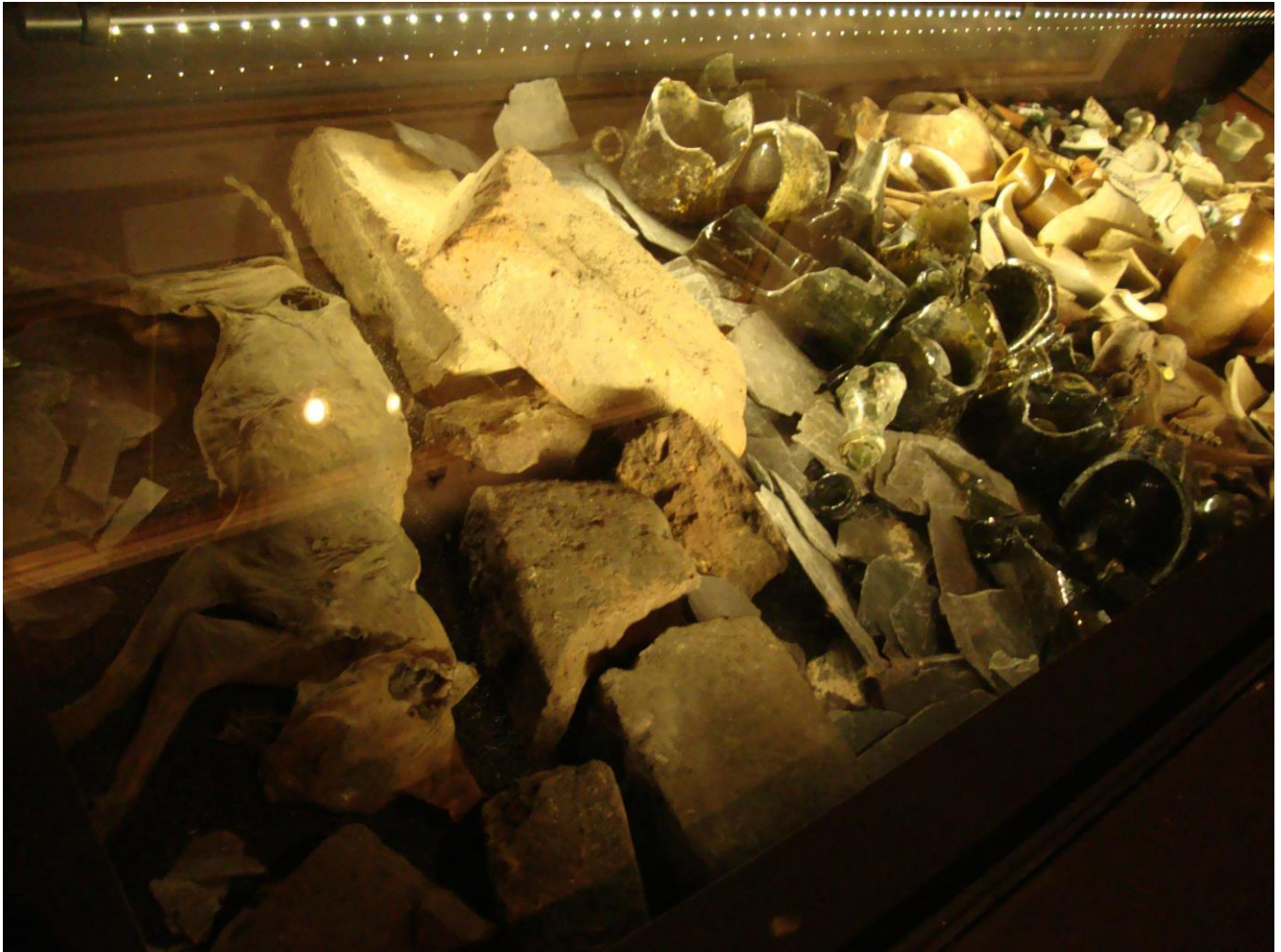
Figure 2 – The larger cat in the case.

Over the period between object selection and installation it became apparent that the dead cat the group had wanted to use was still decomposing. Its chemical instability meant that it couldn't be used in the case, so the project participants' plans could not be followed. Happily, the museum already had a second dead cat already in the collection. The second dead cat was more stable and could be used in place of the one the group had originally selected. However the replacement dead cat was much larger than the group's choice, so the case was much more crowded than the layout that group had intended (Figure 2).