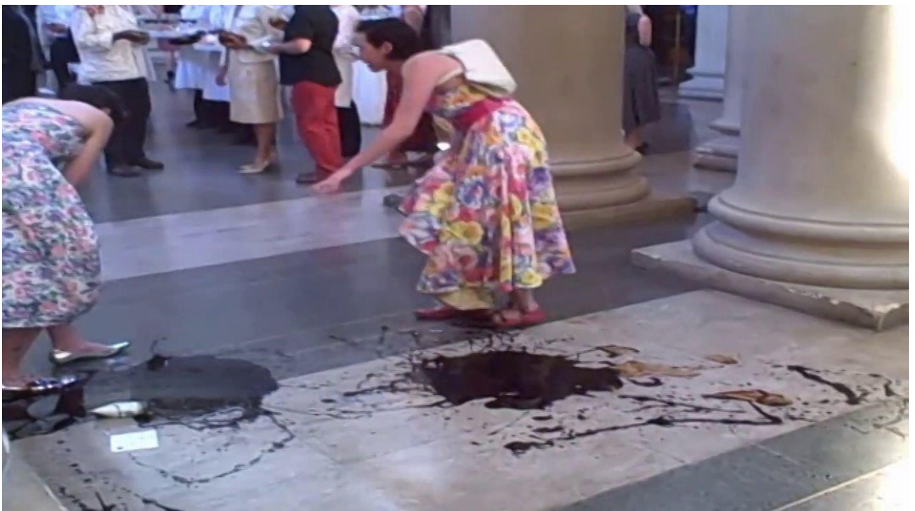
Figure 2- License to Spill , Liberate Tate, Tate Britain, June 2010. Film Still © You and I Films.

But what does it mean for a gallery to have an 'ethical' identity? And why is corporate sponsorship a problem, when increased funding might allow galleries such as Tate to function better and to reach out to a wider audience, perhaps through maintaining or increasing free exhibitions and resources?