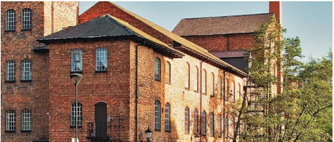
Figure 5 - Derby Silk Mill.

One of the current projects at the Silk Mill is to establish 'art' as one of the core academic disciplines. The widely known concept of STEM disciplines (Science, Technology, Engineering and Maths) does not include art, but by adding 'Arts' to the acronym, making it 'STEAM' - The Silk Mill acknowledge the importance of creativity in educational and technological innovation. The Silk Mill is partly funded by the Happy Museums Project that focuses on creating environmentally sustainable cultural spaces.