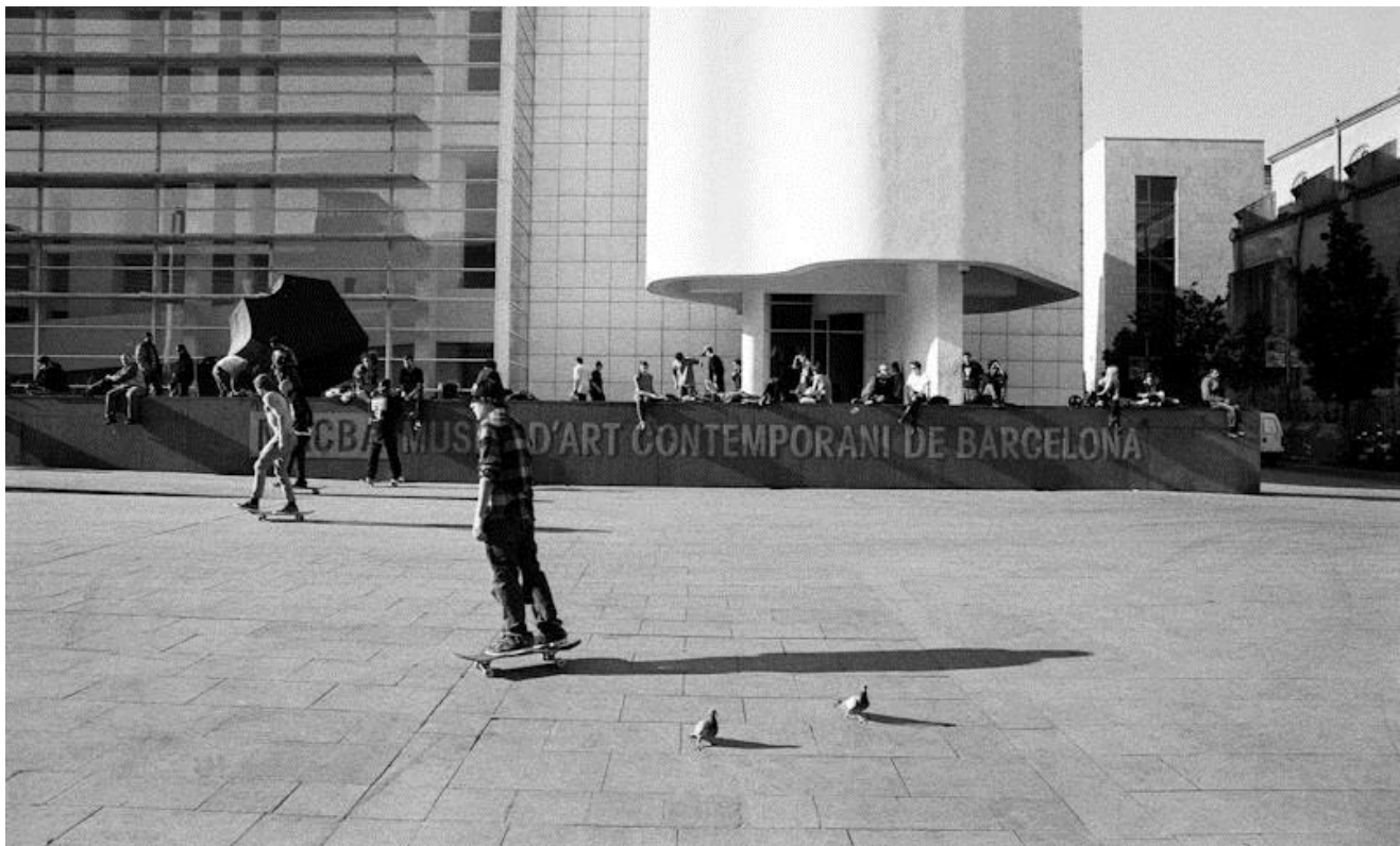
Figure 3 - Skateboarding at MACBA.

One of the notable things about MACBA's curatorial approach is that it endeavours to reach beyond its immediate audience and establish communicative channels throughout the city and beyond, to people who are not necessarily gallery-goers, as well as providing a platform for artistic practices that fall outside mainstream cultural discourses (Figure 3). It 'spaces' itself with its audiences, and by communicating with people throughout the city. Its identity is formed through socially responsive exhibitions, rather than complying to a set agenda.