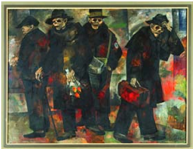
Image 5. Hermann Sohn, Die schwarzen Männer , 1934, © Kunstmuseum Stuttgart.

The Black Men (Image 5), painted in 1934, now in the Kunstmuseum of Stuttgart, shows four men with death's heads, in black robes, reminiscent of undertakers, one of whom has a swastika armband. Subtitled, The Rats Are Leaving the Sinking Ship , the painting presents an allegory of intellectuals bowing to the Nazi regime: a worker, an aesthete with a bunch of flowers, a journalist with a bag full of newspapers, and a scientist with a doctor's case. Even more remarkable, but less known, 9 is a painting from 1938 titled Kristallnacht (Image 6) picturing a Jewish girl in a red robe on her knees praying, in the background a seven-armed candlestick and the star of David. Sohn had witnessed the raid of a Jewish orphans' protectory in his native Esslingen. When he tried to call the police, he was threatened by an SA henchman whilst children fled to the woods. The experience resulted in the creation of the current canvas, but was never publicly displayed.