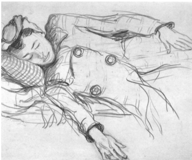
Image 3. Ernst Kunkel, Frau im Bunker, 1944, pencil on paper, private property, © Max Kunkel.

brother Eugen ( Image 2 ). Even in war time, some of his drawings, as for instance a woman sleeping in an air raid shelter, are extremely realistic and betray the work of a very sensitive painter. ( Image 3 ).