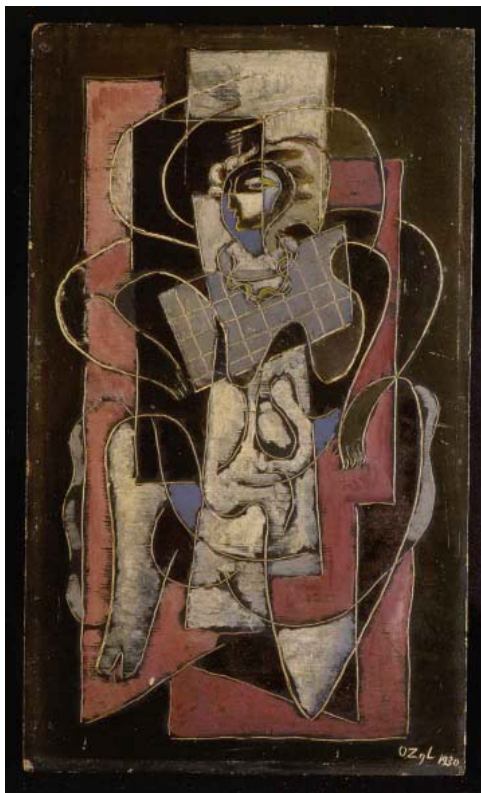
Image 8. Oskar Zügel, Genotzüchtigte Kunst III, Joseph Goebbels, 1930, signed and dated, 46,3 x 27 cm, © Katja Zügel.

Before leaving Stuttgart, Zügel had begun to work on a huge canvas that he later called his Schicksalsbild (picture of destiny). It was completed in Spain where it remained in his house until his return. The long title reads Victory of Justice – Downfall of the Unlucky Star Hitler – Destruction of Stuttgart (Image 9). The painting was not contained in the recent exhibition Kassandra at the Deutsches Historisches Museum (November 19, 2008 – February 22, 2009) which focused on the Ahnungen und Mahnungen , (forebodings and admonitions) of artists of the twentieth century in front of imminent calamities (Heckmann and Ottomeyer 2009), although a more prophetic picture has hardly ever been painted. In a cubistic turmoil of splintering forms caused by a red cannonball signed by the swastika, bodies are tumbling down like fallen angels, while flames are flickering, apocalyptic riders seem to shoot their arrows and only the ruins of burnt-out houses seem to remain at the verge. Ten years later, the town of Stuttgart, like many others, was in fact little more than a field of ruins and Hitler was doomed.