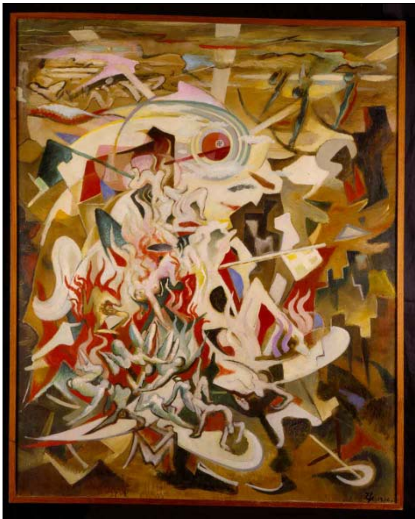
Image 9. Oskar Zügel, Sieg der Gerechtigkeit, Untergang des Unsterns Hitler, Zerstörung der Stadt Stuttgart (Schicksalsbild), 1934/ 1936, signed and dated, oil on canvas, 163 x 130,5 cm, © Katja Zügel.

Spain and France as well as Hamburg and Berlin. From 1925 on, he turned to abstraction and spent the time between 1933 and 1945 between Mallorca, Ischia and France. Evidently, he had grown out of the Stuttgart circle to become an international painter.