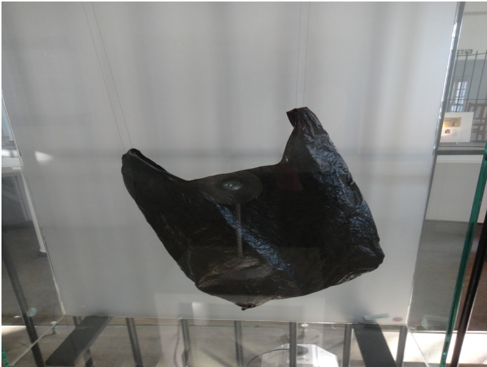
Fig 2. The Shopping Bag

Taken together the videos and the clothing in these two installations situate the memory of the women detainees in two frames, one that memorializes their arrest and loss of rights and the other that reifies their domesticity and the gendered forms of discrimination that led to incarceration. The cell itself is small, cramped, and poorly lit, further commemorating the conditions under which women were taken into custody and were frequently punished by being placed into isolation. Other testimonies, which are featured outside the cells, make it clear that isolation was among 'the cruelest' forms of punishment.