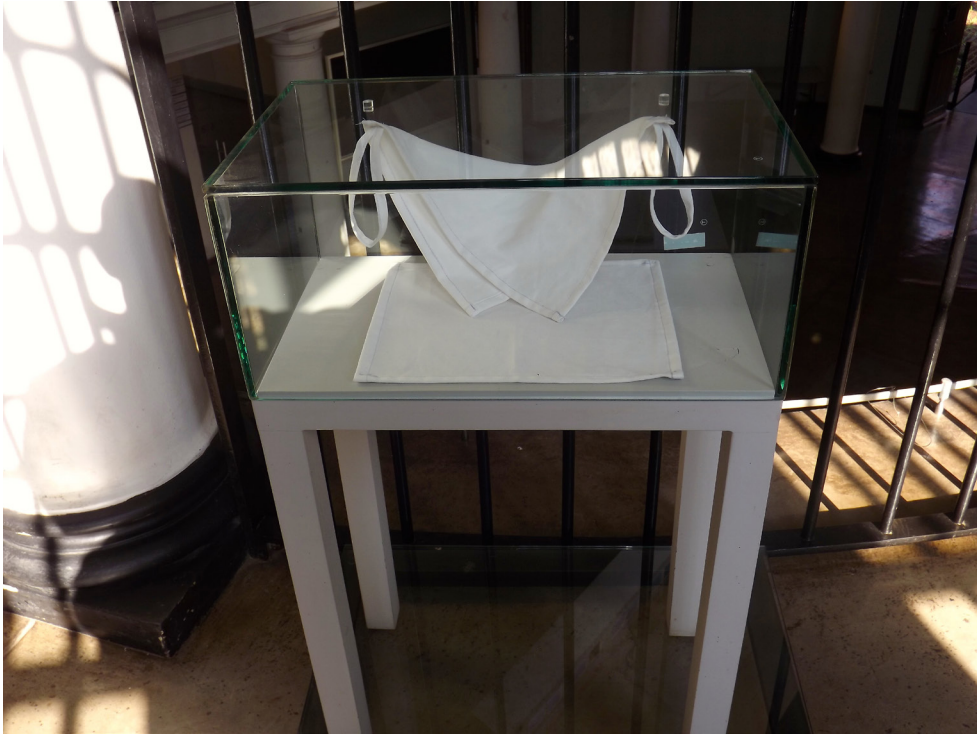
Fig 5. The Sanitary Pad