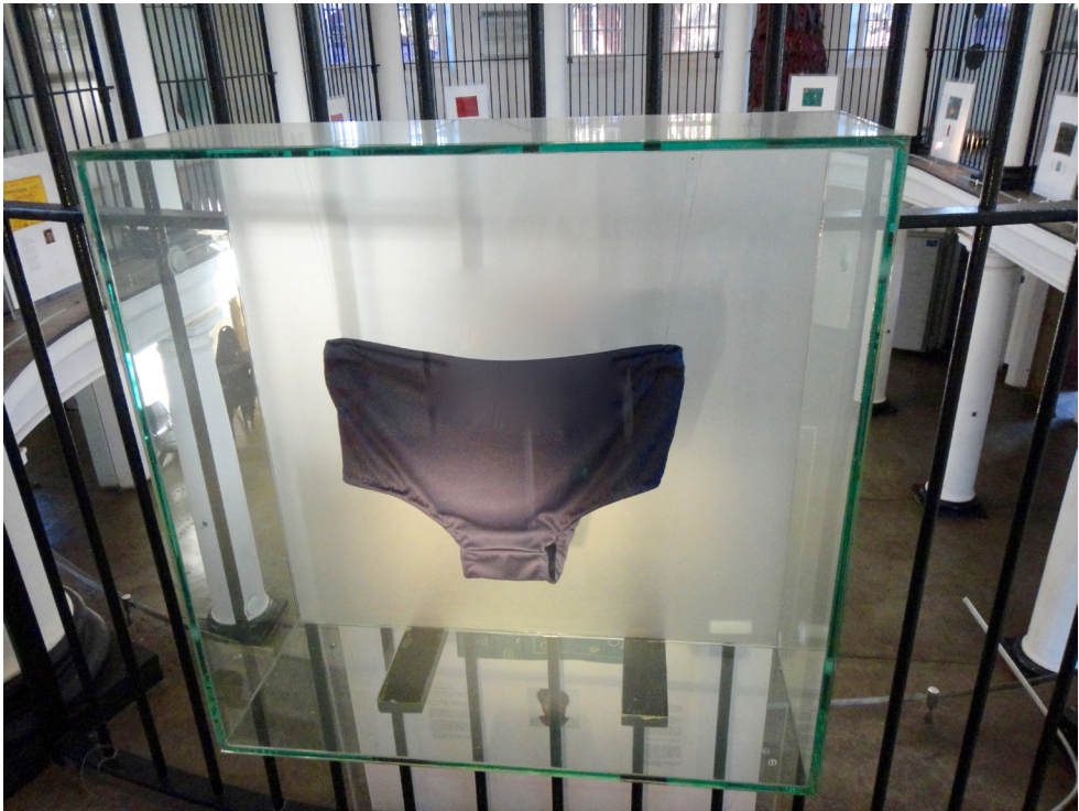
Fig 3. The Panties

the museum, a passbook and a plastic shopping bag (Figure 2) symbolize the discriminatory laws that led to the imprisonment of many Black women. The pass book, a remnant of the apartheid regime, serves as a symbol of discrimination and persecution. Under apartheid, Black people in South Africa were restricted to certain areas and had to carry their pass book at all times (Waetjen 1999). As a form of continued harassment, many Black women were arrested on pass book violations while going about their daily routines. On exhibit is the torn and well worn passbook of a prisoner whose faded picture places this history of discrimination in the distant past, even while the memories that are recreated in the jail provide a visual and emotional context through which to re-experience apartheid in the present.