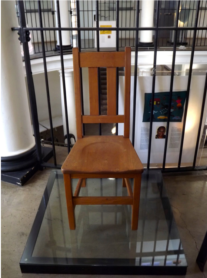
Fig 4. The Chair