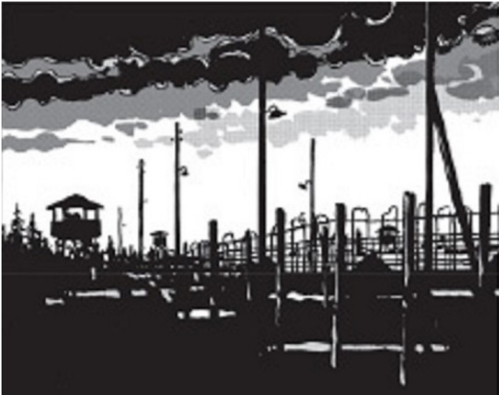
Image 4. Stalag XB Sandbostel, Malet/Tardi, 120 Rue de la Gare, p. 12 © 2006 Edition Moderne Zürich

the occupied countries, but also about 100 km from Bremen in camp XD (310) Wietzendorf, where up to March 1942 14,500 Soviet POW died. Three photographs, which we found in the catalogue of the revised exhibition Verbrechen der Wehrmacht. Dimensionen des Vernichtungskriegs 1941-1944 (Hamburger Institut für Sozialforschung 2002) illustrate the circumstances in this camp. These unofficial photographs, termed Knipserfotos (snapshots) in a historic context, were taken by unknown persons, probably by soldiers deployed in the camp, for private purposes. On one picture Soviet POW are depicted, arriving and waiting for registration and disinfection, another picture shows the burrows. Especially the so called Fleischwagen ('meat cart') depicted on the third photograph leaves a disturbing impression. It shows a cart overloaded with dead bodies of Soviet POW, while four men in uniform, probably Soviet POW, on top of the cart, that is on the corpses, are either unloading or loading the cart. Next to the cart stands a young man, Soviet POW (?), thunderstruck staring at several dead bodies on the ground. This photograph is the only one of this shocking and unintentional, even iconic quality. It 'attract(s) strong collective attention and emotional reaction. (...) Unanimity exists (...) that iconic photographs foreground symbolic values' (Ruchatz 2008: 374).