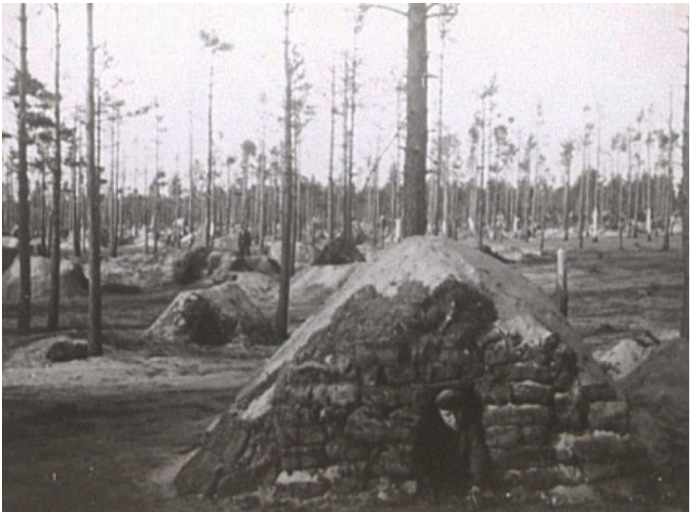
Image 3. Burrows in StaLag XD Wietzendorf, Staatsarchiv Hamburg, 213-12 NSG 4 Bd.7 Nr.17

Before being allocated to the various work commandos the captives were registered, medically examined, disinfected and vaccinated in the main camps. Bremen belonged to the Wehrkreis (military district) X, three main camps were responsible for the allocation of work commandos to Bremen: StaLag (= Stammlager) XB Sandbostel, StaLag XC Nienburg (only organization and administration of labour deployment of POW) and StaLag XD (310) Wietzendorf ( Russenlager , since 1943 central hospital for Soviet POW in Wehrkreis X).