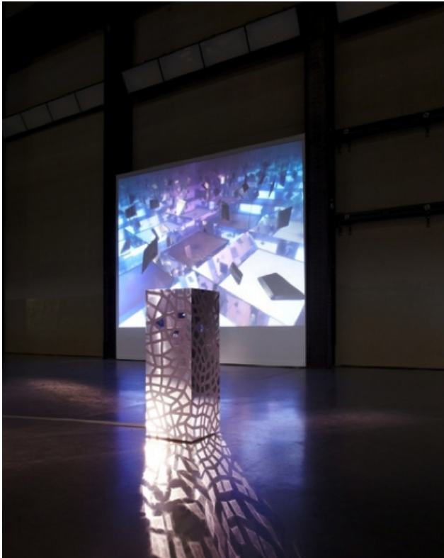
Fig 1: The Hello Cube

What became evident in the interviews was how fully enmeshed each and every one of Tate's initiatives in this area inevitably is with debate about ethics, despite the projects' varying audiences and ambitions. Digital ethics were a fundamental concern to all of the interviewees we spoke to, manifesting in varied discourses for different areas of the institution even as individuals