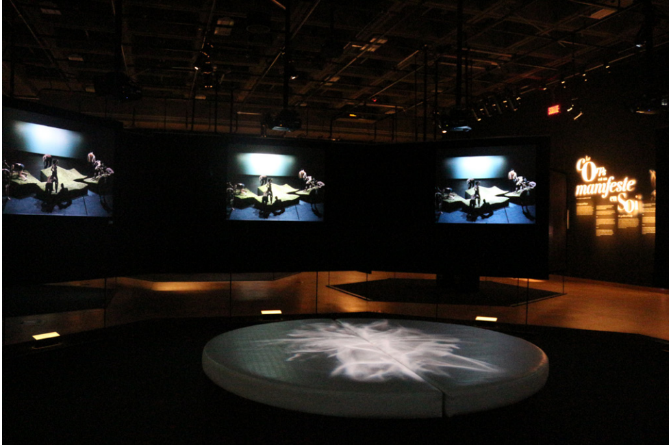
Figure 3. The Rite of Spring installation in Rebel Bodies (Musées de la civilisation. Photo: Audrey Brossard)

provide insight into the basis of contemporary dance: definitions, history, key concepts in screenplay, authorship, specific codes in dancing as well as genres of social dances that make the body social.