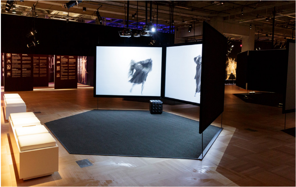
Figures 4-5. Views of the exhibition's immersive units, each developed in collaboration with partner artists