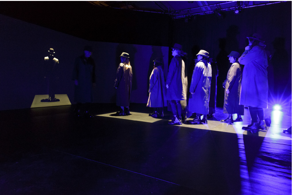
Figure 8. Artists and museum staff photographed in the Studio during a test visitor performance of Joe (Musées de la civilisation. Photo: Jérémie LeBlond-Fontaine - Icône)