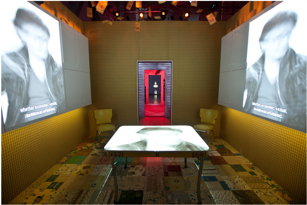
Figure 1. Michel Tremblay exhibition, March 14, 2012 to August 18, 2013 (Musées de la civilisation. Photo: Nicola-Frank Vachon – Perspective Photo)

Rebel Bodies has been an opportunity to reflect on the use and validity of ethnographic materials as effective means through which dance is mediated, most notably through video and photography (see, e.g., Greenfield 1998; Taylor 1998). Such an approach is particularly useful in a theme-based museum like the Musées de la civilisation, where traditional collections-based research has been set aside in order to develop and continuously probe new forms of transmission and communication of knowledge informed by principles of a multi-vocal museology. While most MCQ exhibitions have relied on objects to illustrate narratives, more recent projects have explored the potential use of video and sound archives (approached as artefacts). A recent example is the exhibition on Quebec author and playwright Michel Tremblay that was entirely built without objects (from museum collections), favouring instead a total visitor immersion in videos to highlight the author's creative and imaginative universe