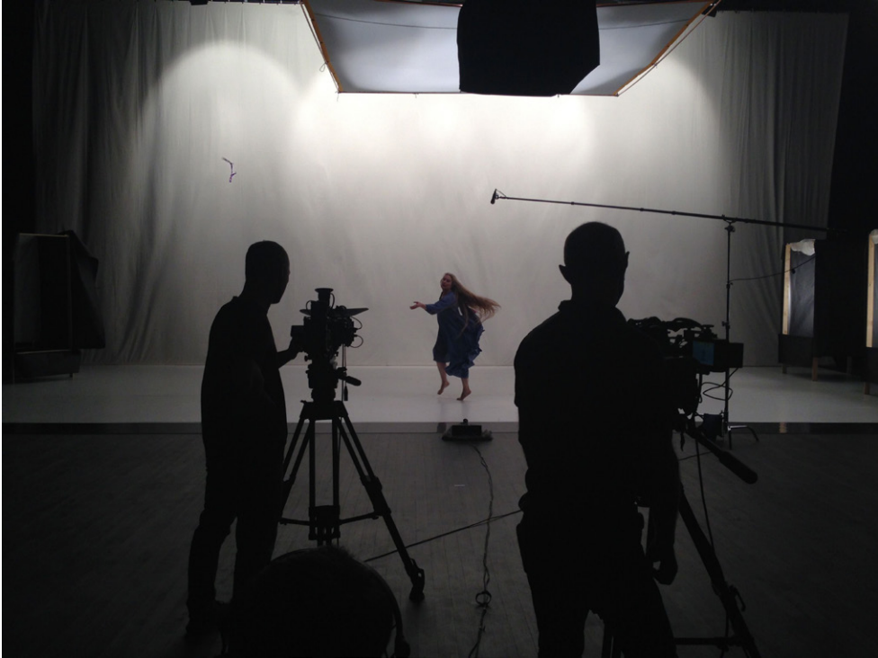
Figure 6. Artist Margie Gillis performing during video shoots at the Musée de la civilisation (Musées de la civilisation. Image courtesy of Margie Gillis)

Snapshots of the storyboard created by the artists and MCQ staff were also included in the final projections and showed on screen in order to illustrate the creative process during performances. The final edited versions made available to visitors link the artist interviews, the filmed performance and storyboards, with added cinematographic effects – all of which provide an inclusive audiovisual interpretation for each bodily state.