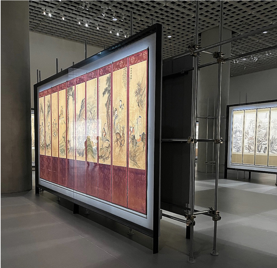
Illustration 4: Designed structure made from reusable materials.

The museum also made efforts to explore exhibition strategies that are environmentally-friendly, minimize waste and utilize reusable materials. This aligns with Robert R. Janes' (2024: 92) provocation that 'museums have obligations, not rights or privileges', emphasizing the belief that: