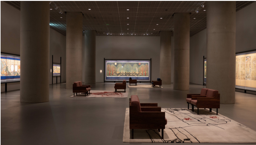
Illustration 3: Second exhibition space view with carpets and sofas.

preconceived notions of traditional Korean art. This space utilized environmentally-friendly exhibition installations, featuring an experimental steel structure prominently placed in the centre of the exhibition hall (see illustration 4). This offered viewers the opportunity to observe the front, back, and sides of the folding screens from various angles, creating a well-defined distinction from the ways in which the traditional screens were displayed. By incorporating a modern atmosphere in the spatial design, the exhibition enhanced a connection between the traditional Korean painting and visitors.