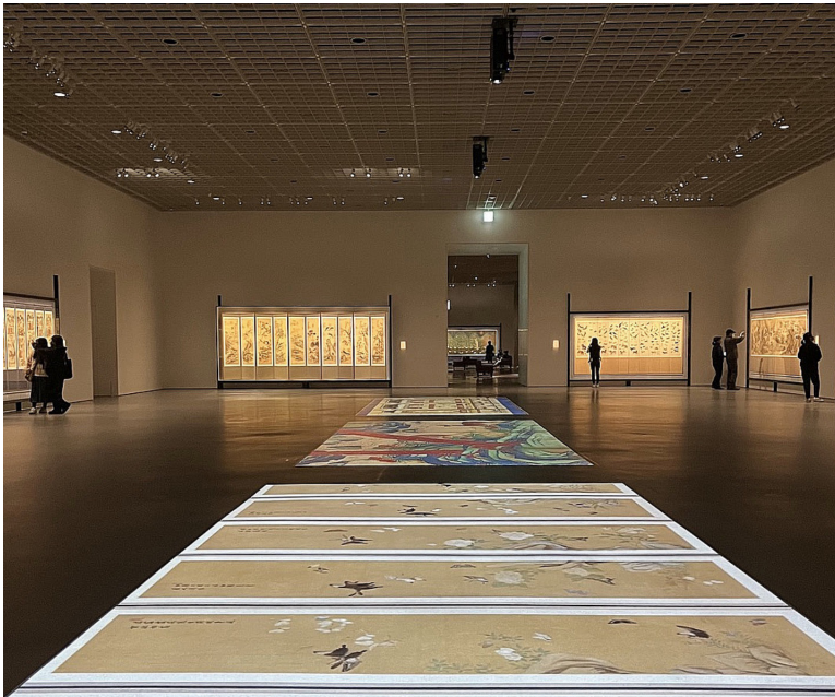
Illustration 2: First section of the exhibition view with digital beam projector in the centre of the exhibition.

At the entrance to the exhibition hall, ‘civilian’ screens were displayed, which captivated the viewers’ attention. These screens are characterized by their abundance of humour and playfulness and are devoid of distinct rules or regulations in how they were created. By positioning these screens at the start, the exhibition was imbued with a sense of freedom. Additionally, a beam projector in the central part of the exhibition hall illuminated the intricate details of the screens, enabling visitors to enjoy the finer elements of the screens in a spacious setting (see illustration 2).