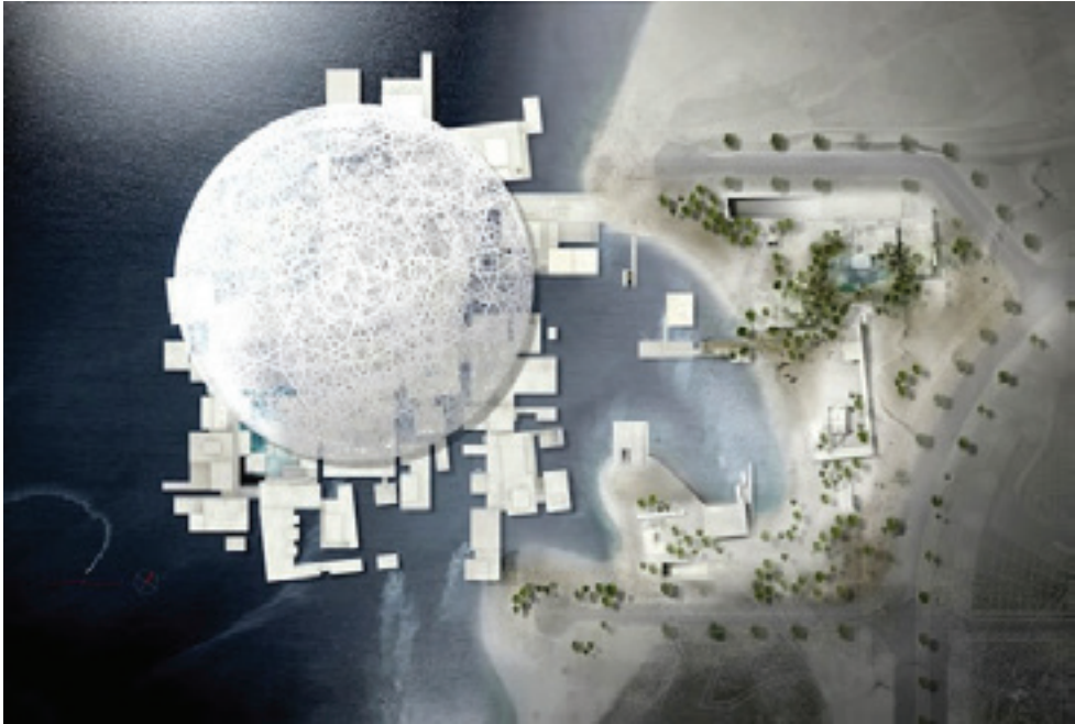
Image 1. Louvre Abu Dhabi: aerial view and site plan.

unparalleled opportunity to take their 'imagination to even greater heights' and pioneer 'the most dramatic currents of early twenty-first-century architecture' (McClellan 2012: 272-277). This new trend of deliberately commissioning prominent names of international repute and strategically attaching famous brand names to new museums and cultural projects in the region has become an important means by which countries in the Gulf are seeking to gain 'instant cultural recognition' and prestige (McClellan 2012: 275) and an expression of a political drive to construct a new identity for the region and modernize its societies (see also Bouchenaki 2013: 95). As McClellan (2012, 277) explains: