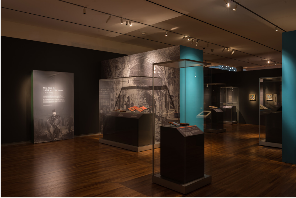
Fig. 7, Transforming Traditions: The Arts of 19th-Century Iran. Sep 22, 2018 - Feb 10, 2019, The Aga Khan Museum.

On the other hand, traditions and traditional arts are themselves undoubtedly transformed through their encounter with the 'contemporary,' i.e. cutting-edge, innovative practice. Taking these considerations from the historically and culturally specific context of the exhibition to contemporary discourses around global art production today, a crucial question arises: 'what is 'contemporary' and what is 'traditional' art, and who decides?'.