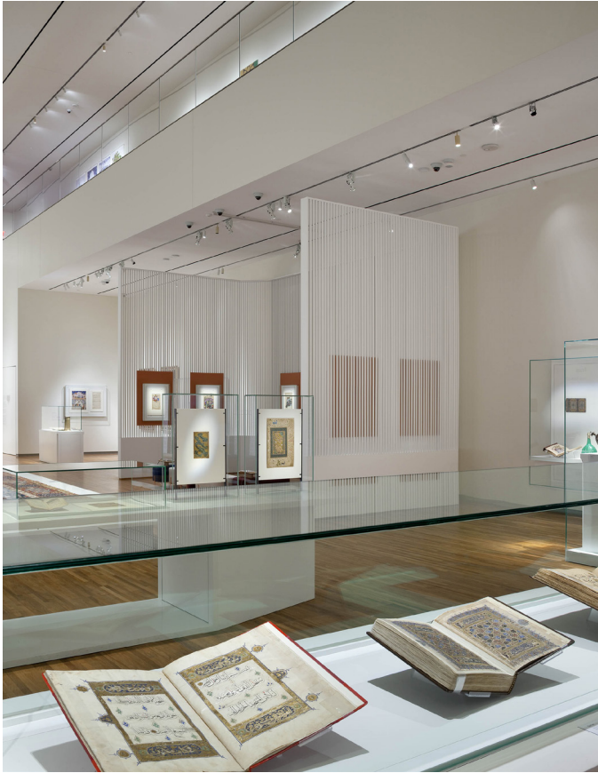
Fig. 4, Qur'an Manuscript, copied by Ismail b. 'Abdullah of Makassar, Indonesia, Sulawesi Island, dated 25 Ramadan 1219 AH/28 December 1804, Ink and opaque watercolour on paper, 34.9 × 22.7 × 9 cm © The Aga Khan Museum, AKM488

their potential to engage visitors to the Bellerive Room with a host of relevant stories beyond the context of Islamic art. The question is: could some of them still be recovered and restored, and should they be?