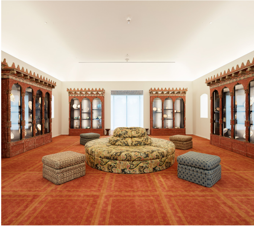
Fig. 1, Bellerive Room, The Aga Khan Museum.