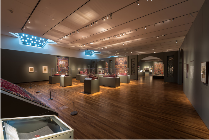
Fig. 5, Emperors & Jewels – Treasures of the Indian Courts from the Al-Sabah Collection, Kuwait. Aug 18, 2018 - Jan 27, 2019, The Aga Khan Museum.

conventionally interpreted in isolation from the rhythmic recitation, rhetorical improvisation, literary discourse or musical accompaniment that might have once 'made them whole' in their original contexts. In routinely ignoring the integral intangible dimensions of Islamic artefacts, meaning is not only lost, but Islamic art history becomes distorted. The question posed to participants consequently focused on how we can meaningfully reconstruct the original, contextual 'wholeness' and significance of an Islamic artefact in a museum context by using its material presence as a departure point to explore its inherent intangible dimensions and meanings. This question is particularly important given the fact that among the cultures of the Islamic world, many of the intangible arts have traditionally been considered just as worthy – if not sometimes more so – than their material manifestations.