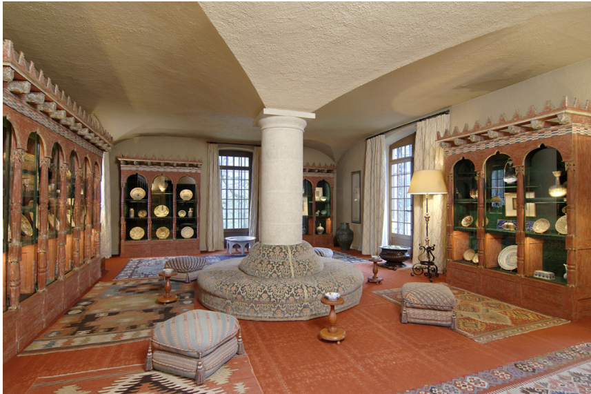
Fig. 2, Persian Salon. Chateau de Bellerive in Geneva, Switzerland.