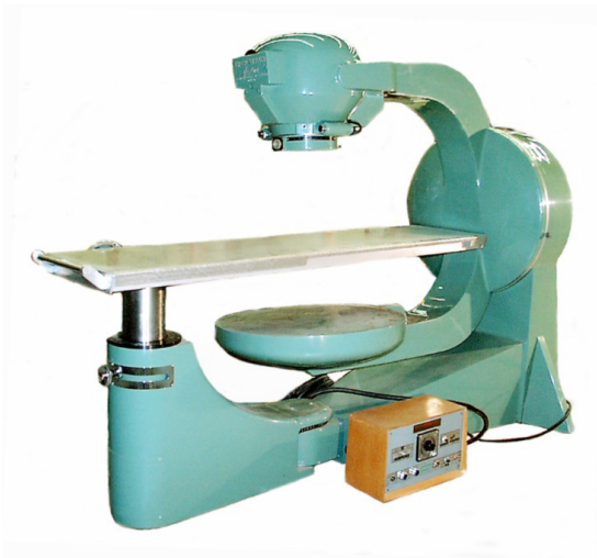
Figure 3. Theratron Junior, 1956. Atomic Energy Canada Ltd.