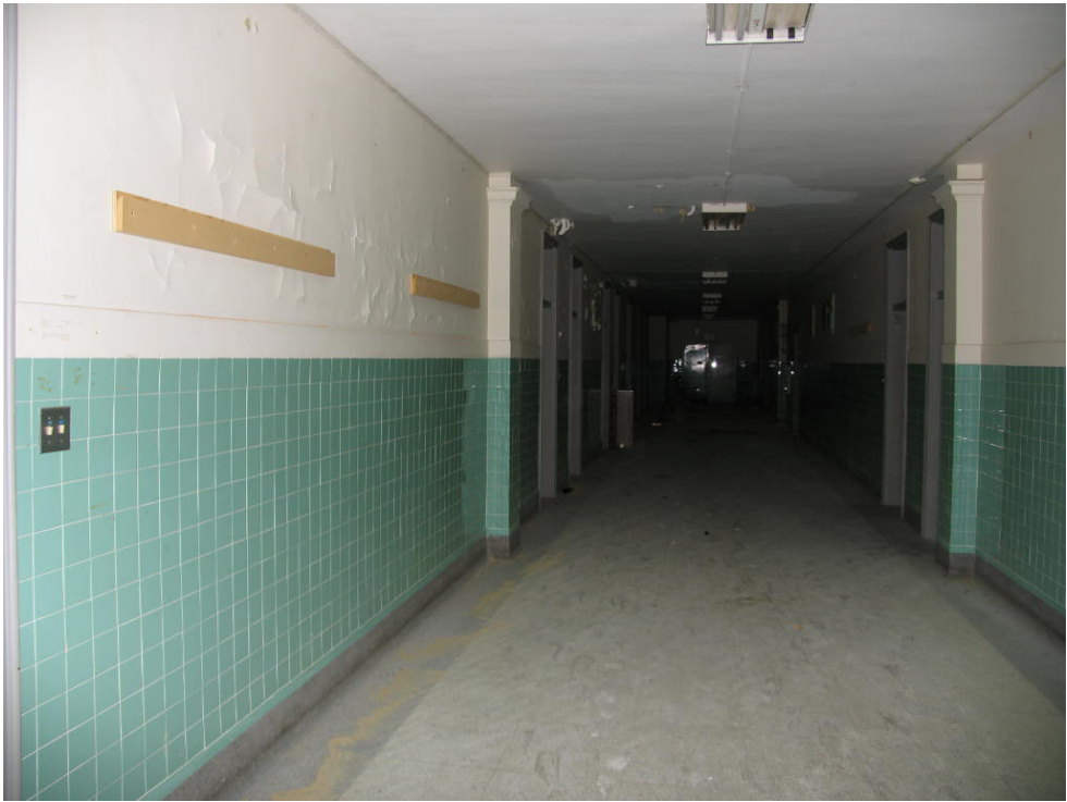
Figure 4. Green tiles in Weyburn Hospital (now demolished)