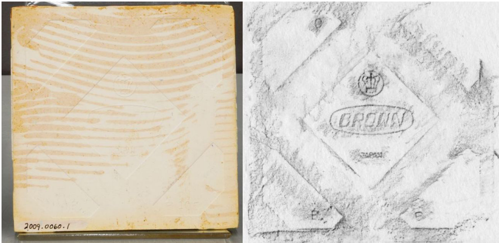
Figure 5. Crown label on back of tile discovered in our conservation labs (image of pencil rubbing on left to show 'Crown' and 'Japan' more clearly).

There is also an international dimension to these tiles at the Weyburn: they were made in Japan by a ceramic company called 'Crown'. One of my colleagues in conservation discovered this almost-hidden feature during a careful examination in our conservation labs. This industrial label brings us into another human aspect of the tile's history - Japanese workers at a particular factory made hundreds of these tiles for circulation around the world. The tiles presumably went into kitchens, prisons, schools, and hospitals. It would be a difficult but rewarding research project to trace the green Crown tiles to all the places they travelled, and the impact they had. The Japanese workers around the time of 1960 could not have imagined the supply-chain of their production. This is a line of questioning that could be fruitful for the historical and geographical imagination, especially in a museum setting.