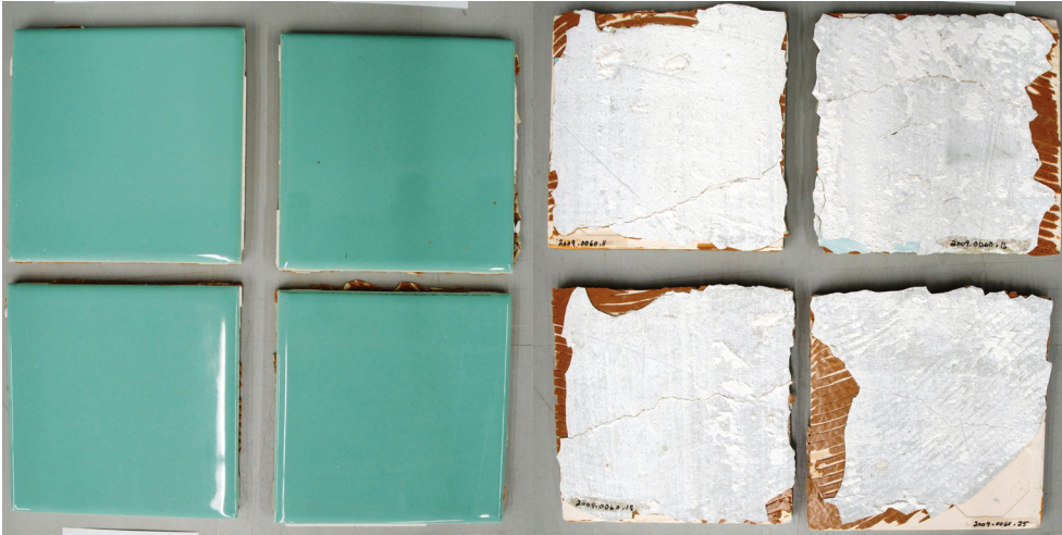
Figure 2. Green tiles, front and back. There are thirty-six glazed green tiles preserved in storage at Ingenium. They each measure 10.9 by 10.9 cm.