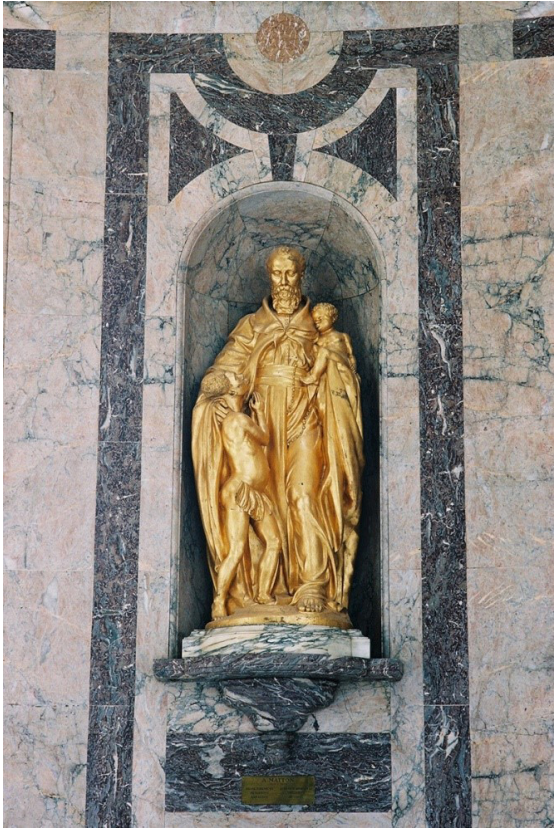
Illustration 3. 'Belgium Brings Civilization to Kongo', original statue by Arsène Matton

It is remarkable that a museum dedicated to the African continent and its people reopens in 2018 and still showcases 'traditional' African Art in combination with stuffed animals such as lions and crocodiles. A new addition is the audiovisual material in some halls, such as film and video incorporating contemporary Congolese men and women explaining daily life, customs, and rituals; nevertheless, the emphasis is unmistakably on material culture and art. Housing one of the biggest collections worldwide of Central African Arts, it is not hard to stuff the museum once more with ritual objects from the region. But this strategy takes the focus away from what should really matter: providing a more nuanced image of the history of Africa, removing the museum's racist image, the discriminatory pedagogic project that it helped instill for over a century. For example, of the important work in Eastern Congo of Doctor Denis Mukwege, 2018 Nobel Peace Prize Winner, nothing is mentioned inside the museum, nor are any other important, hopeful stories. A tall, female robot serves to illustrate the corruption that is rampant in contemporary Congo. In Kinshasa today, this robot acts as a traffic controller at busy city intersections, as a way of fighting corruption among the police in Kinshasa, according to the short accompanying label.