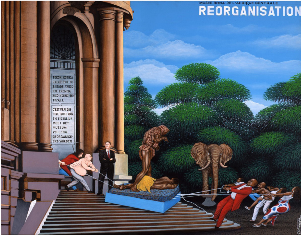
Illustration 2. Musée Royal de l'Afrique Centrale, Réorganisation (2002), Chéri Samba

What is crucial in these discussions is that there is dialogue between the parties involved. And that is often lacking. Imagery and representation of non-European art—and, thus, also people—is inextricably linked with power differentials that are inherently embedded in these controlling processes. For the Africa Museum, it is important to investigate such possible pitfalls and opportunities, as 'the last colonial museum' or 'the last cabinet of curiosities' has reopened. What precisely has been done during the five-year closure? What can other institutions learn from this one?