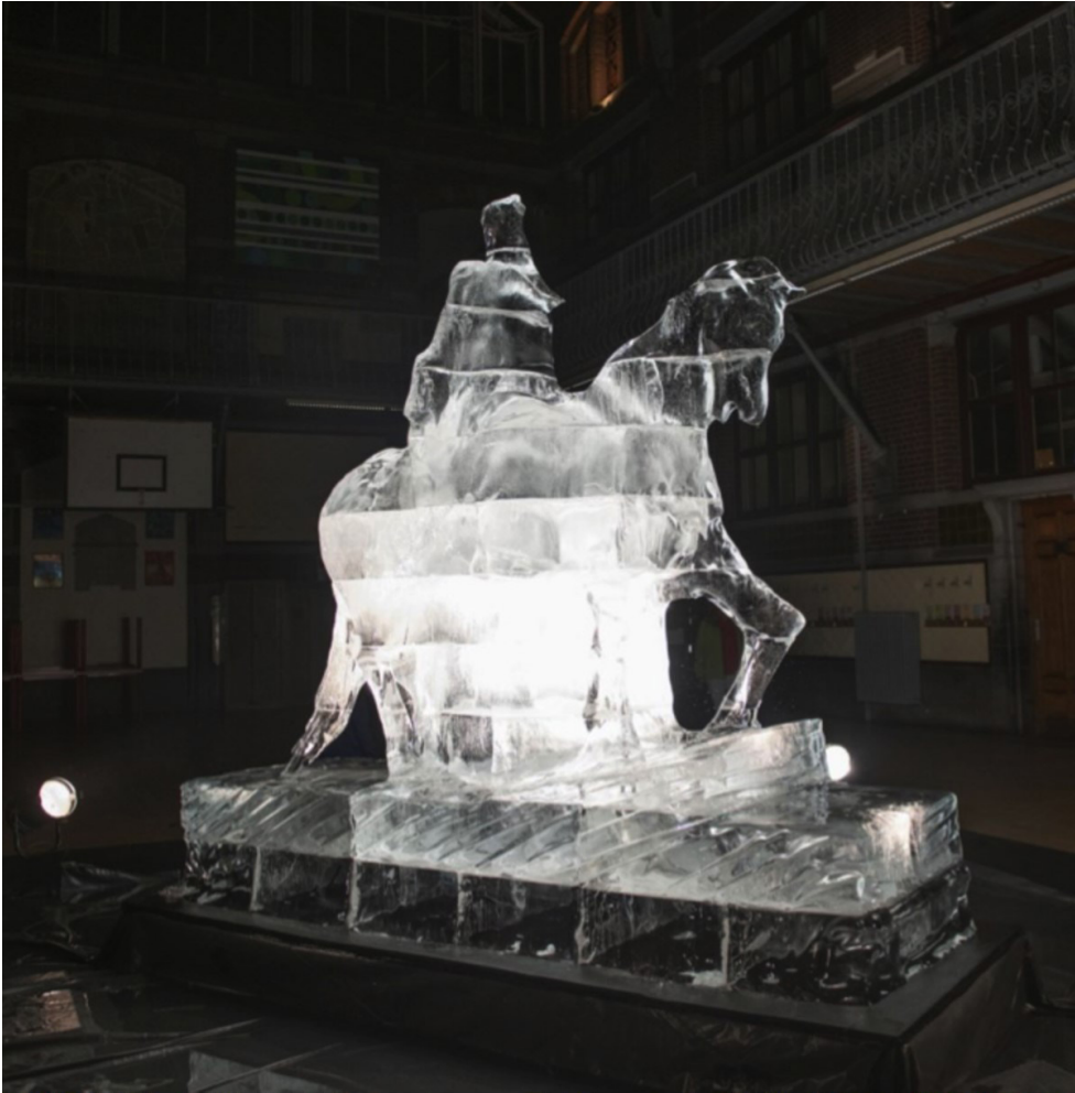
Illustration 5. PeoPL, by Laura Nsengiyumva (copyright De Standaard, Bea Borgers)