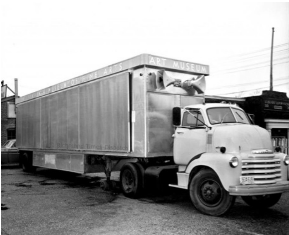
Figure 1. "Artmobile I," 1954.

Within this timeframe, the Artmobile presented a total of sixty exhibitions to its Virginia audience. To analyze all sixty exhibitions is beyond the parameters of this article; additionally, archival evidence varies for each exhibition, as there was no explicit initiative to create comprehensive files of all educational materials for each exhibition. Therefore, an examination of five exhibitions and their educational materials is subsequently presented in chronological order. This article first presents a brief history of the Artmobile, including a discussion of other mobile museums in the United States that inspired the Artmobile's creation. Although the examination of five exhibitions in relation to parallel philosophies contributes to an understanding of the development of the field of museum education, it is not enough to simply analyze the exhibitions in a vacuum. Indeed, an analysis of the socio-temporal environment during each exhibition must also be examined in order to understand the greater cultural motivations that influenced educational approaches. Applying Tony Bennett's examinations of culture in relation to the social to educational approaches, I will demonstrate how in the course of the mid to