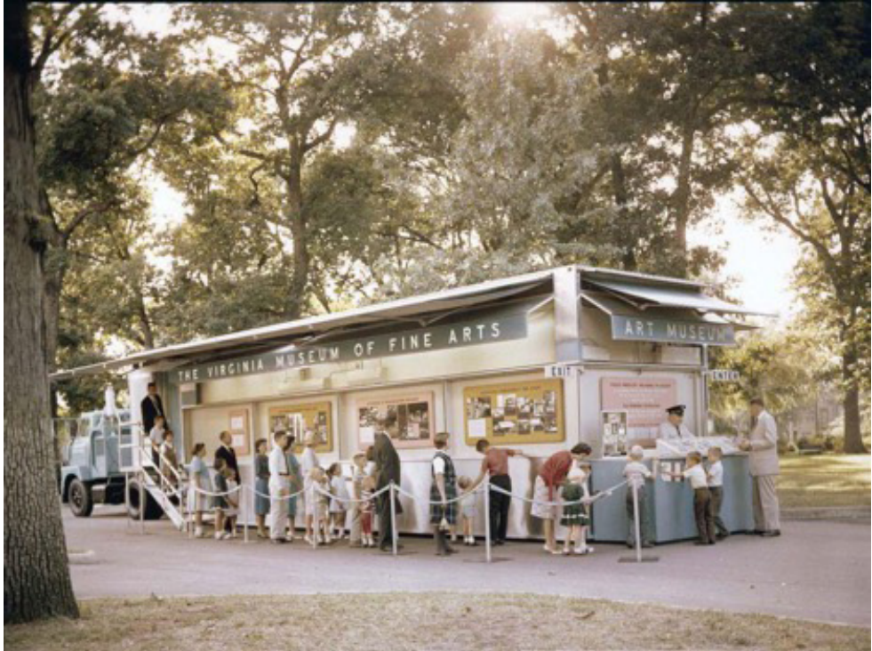
Figure 2. Twelve Portraits: Delacroix to Gauguin exhibition. 1962.

Cheek's solution to these challenges was the Artmobile, for which he drew his original designs in June 1950. Correspondence between Cheek and potential funders for the Artmobile during this time reveal that he was also inspired by bookmobiles, or mobile libraries, which travelled to underserved communities and expanded access to reading materials (Rocha and Marandino 2017: 3). The number of bookmobiles increased in the early twentieth century and,