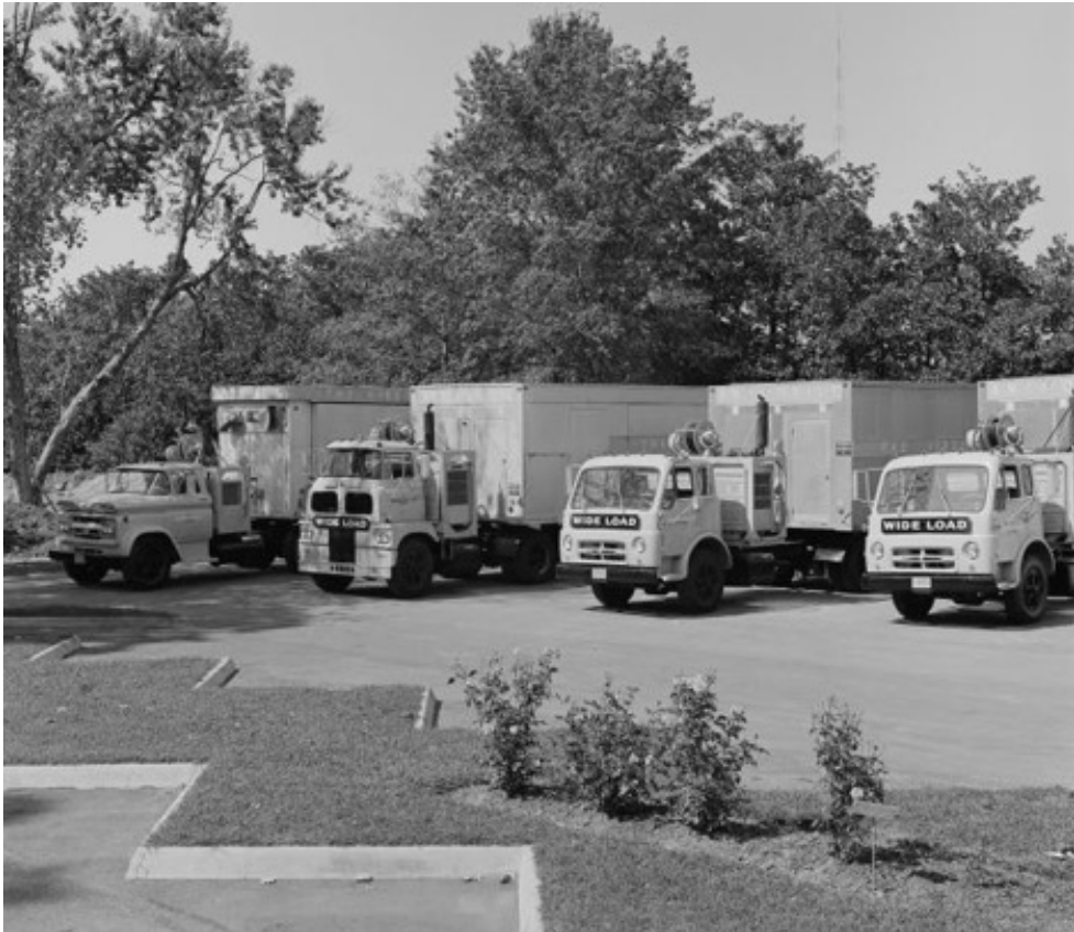
Figure 3. Four Active Artmobiles Parked in the Virginia Museum of Fine Arts Parking Lot, 1967.

In the early 1950s, the VMFA received financial support from the Richmond department store Miller & Rhoads and the Virginia Federation of Women's Clubs to bring Cheek's Artmobile designs to life (Rouser 1985: 114). Artmobile I was a specially-outfitted tractor-trailer, measuring 34 feet in length [Fig. 1]. At each location, the Artmobile was connected to a 220-volt outlet, which allowed for lighting, sound, a security alarm, and air conditioning system (Rouser 1985: 115). The length of stay in each community was determined by its population or by the number of schools and community organizations interested in attending the exhibition (Virginia Federation of Women's Clubs 1953: 2). The VMFA provided advance notice of the works on view and major themes showcased in the exhibition to local school, college, and adult groups. Additionally, the museum sent advertising materials to press, radio, and television outlets at each location to promote the arrival of the exhibitions.