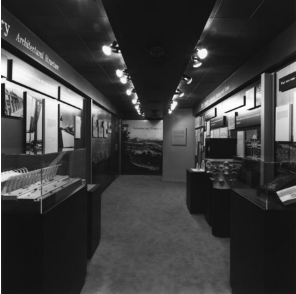
Figure 8. Introducing Virginia Architecture . 1992.

end of the twentieth century. Indeed, as Bennett noted, one of the major turning points from the mid- to late twentieth century was that that 'it is no longer the classed individual that is targeted as the primary surface to which the actions of art and culture are to be applied' (2000: 1420). Instead, an emphasis was placed on empowering communities through the use of artistic resources.