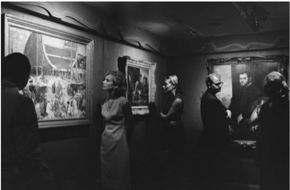
Figure 5. The Williams Collection exhibition. 1965.

In order to develop this greater awareness of art, visitors were given information about the artists, materials, and techniques on display. As described in the exhibition booklet, 'The Little Masters', this exhibition demonstrated how 'few painters have more directly responded to the life of their time than did the artists of the northern and southern Netherlands during the late sixteenth and early seventeenth centuries' (1953a: 1). An emphasis was placed on Dutch landscapes and seascapes as well as characteristics of Dutch life. In examining these particular works, visitors would discover the connection between the artwork of these centuries and the prosperous Dutch nation.