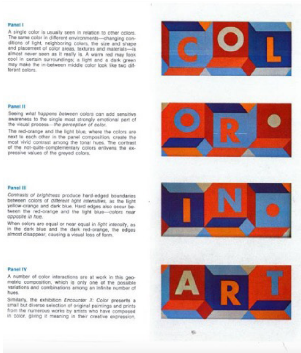
Figure 7. A page from the Encounter II: Color exhibition pamphlet, in which color theories were explained through comparison and contrast. 1972.

effects, to a major role of creative importance' (1972: 3). The relationship between colors was identified as 'a major concern for the artist'; thus, learning to read various color relationships was a necessary component in the development of the visitor's visual literacy (1972: 3).