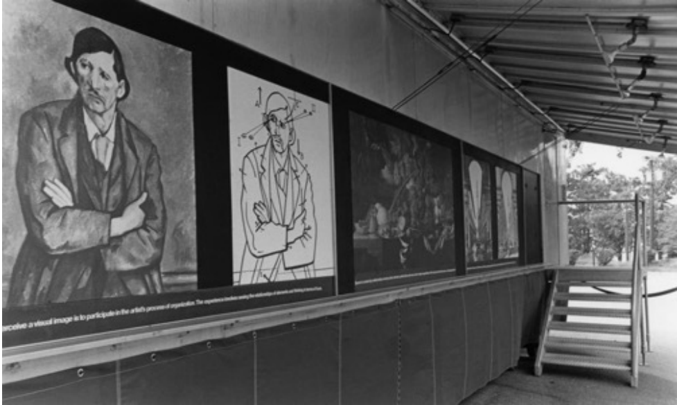
Figure 6. Encounter I: Space exhibition. 1971. Exterior Panels.

Braques' Nature Morte explained the spatial arrangement of the composition: 'The objects in this simplified arrangement are seen from different angles: the goblet is drawn in profile, the dish holding fruit is drawn in plain view while the table top is tilted forward' (1971b). Another example of compositional description is found in the object label for the Peruvian textile, Woven Shirt with Bird Pattern , which described 'the rhythmic progression of the anthropomorphic designs and the horizontal patterning of bird forms' which served as a repetitive measure of space (1971b). In emphasizing the compositional elements and explaining how artists defined space in each work, visitors were provided with a collection of terms and concepts they could apply in their examination of artworks from other periods.