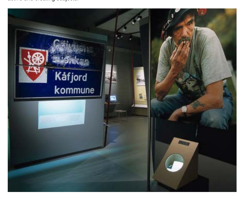
Fig 7. Sápmi: vandalized Sami-Norwegian road sign of Kåfjord municipality by paint and shotgun, in passage from 'the introduction room' to 'room 1'(1945-60).

By describing Sami modernity in terms of how a popular ethnopolitical process writes itself into a context, from private and local socio-cultural life via processes at the nation state and global levels, we sought to make a presentation which could lead the audience away from an objectifying conception of Sami as 'The Other', replacing it with a perspective of Sami as active and creating subjects.