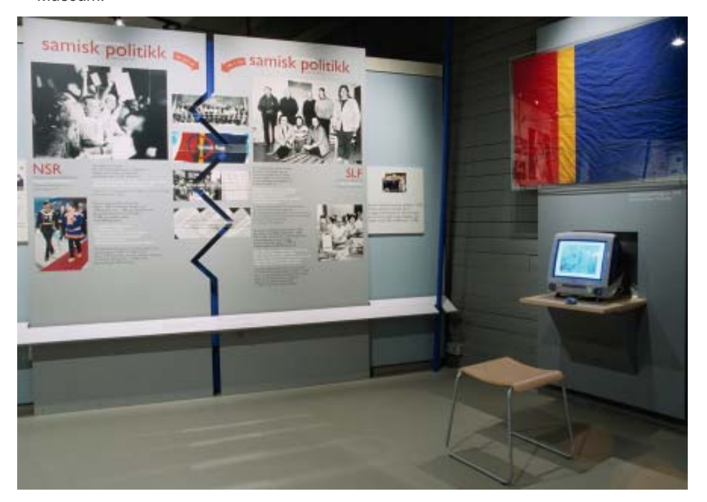
Fig 9. Sápmi: 'room 2' – 1960-80. The display 'Sami Politics' illustrating the emergence of Sami political associations, major themes and contrastive opinions in Sami politics, the first Sami flag (1973), and Emac with interactive video interviews.