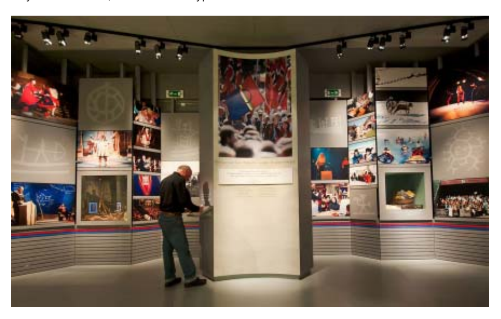
Fig 13. Sápmi: 'room 3' – 'A Nation Emerging'. End wall with photos illustrating the many-sided voices and roles Sami have gained in public space in this period. In middle, a pillar with photo from the Sami flag being used in the National Day celebration in Oslo and the constitutional amendment (1988) giving legal recognition of Sami in Norway as a separate people, and visitor writing comments.

It is, therefore, interesting that some visitors do appear to take notice of the difference between the two Sami representations in the museum as expressed by comments in the visitor books. Many foreign visitors also note the difference between Sápmi and other museums' emphasis on essentialist descriptions of indigenous peoples and cultures. This seems to be confirmed by comments by visitors to guided tours and lectures in Sápmi by the staff of the museum's Extension Service as well as tourist guides themselves, that Sápmi is not only a 'new' theme, but also a new type of 'exhibition'.