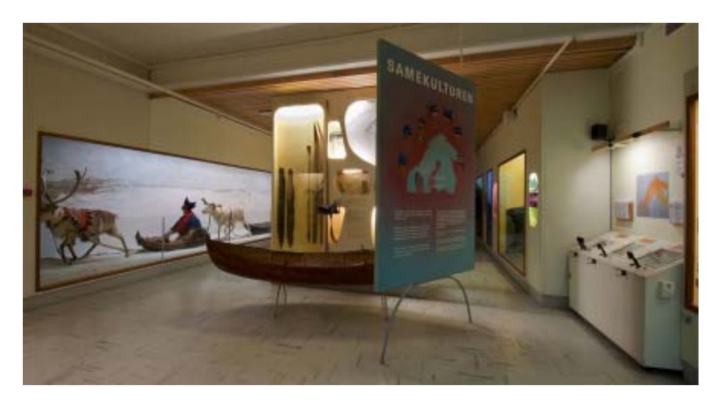
Fig 2. The Sami Culture exhibition: one of three life-size dioramas illustrating scenes of traditional (non-mechanized) reindeer herding.

As initiators and curators for this project we will in this paper present a review of the project, discussing our underlying aims and perspectives and how these have been met in terms of the responses from the public. The purpose of the project was two-fold. Firstly, by making a presentation of a modern indigenous movement, we wanted to present an alternative to how most ethnographic museums have tended to represent the life of indigenous peoples, where cultural history and material objects tend to dominate displays and exhibitions. Secondly, we also wanted the project to provide a basis for an analytical discussion on how museums and the public communicate by monitoring the reactions of visitors.