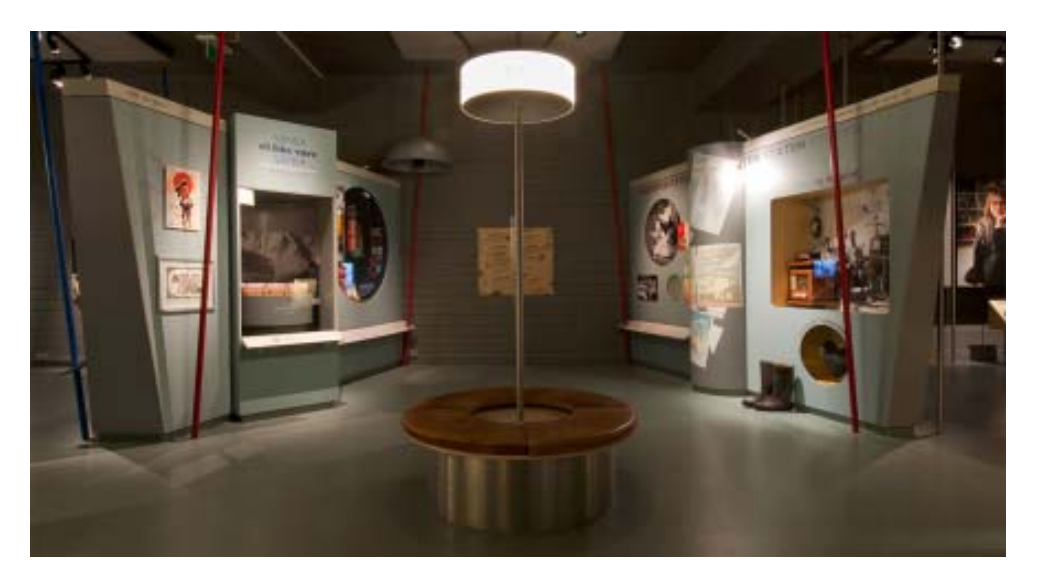
Fig 8. Sápmi: room 1 – 1945-60. Overview of two of the four displays, illustrating the process of Sami involvement in the modern welfare state and the process of Norwegianization among Sami in the period 1945-60.