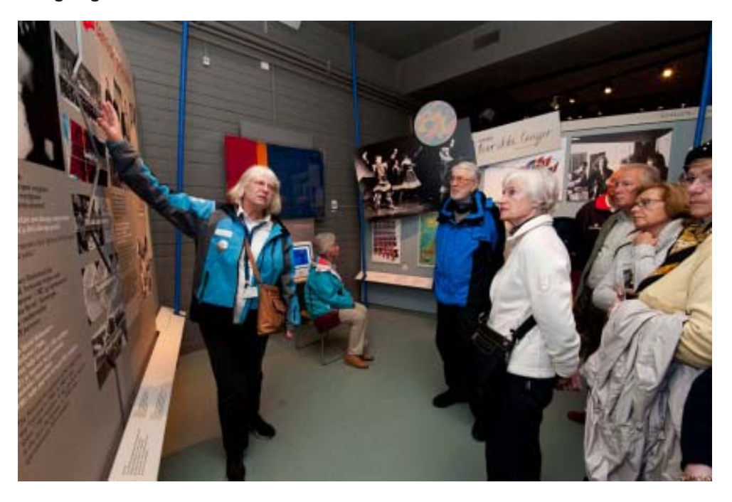
Fig 10. Sápmi: 'room 2' — guide with German tourists. In background, display illustrating the flowering of cultural expressions (theater, handicraft, music, literature etc) of this period.

In terms of what they do and what they do not, museums in general have a long and a fairly common history as actors in the Sami-Norwegian discourse. Thus, we saw an important challenge in designing a presentation that could present a renewal in terms of theme as well as design, while holding on to what has long been the goal of the museum – to make Sami culture and society visible.