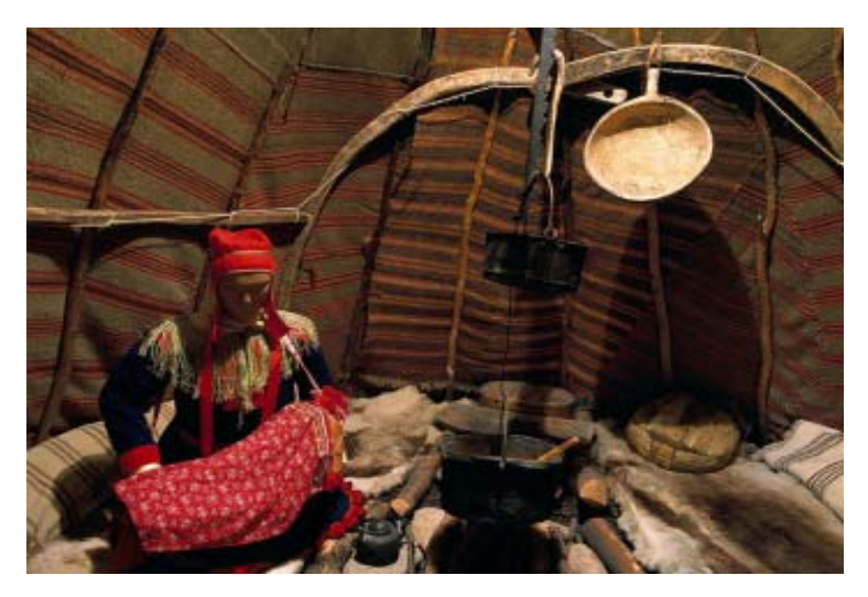
Fig 4. The Sami Culture exhibition: a display termed 'residence' illustrating traditional culture of 'Coast Sami', 'Inland Sami' and 'East-Skolt Sami'.