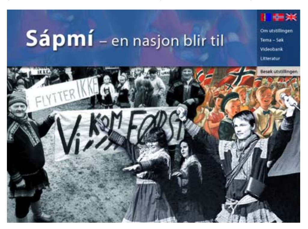
Fig 14. Sápmi web site, in Sami, English and Norwegian versions, including a virtual version of the exhibition, a list of illustrated texts and interactive video interviews with subtitles (English, Sami and Norwegian).

The fact that a museum in Northern Norway has made a presentation of an indigenous movement as an internal project, without any kind of outside and formalized Sami representation, may appear strange or politically problematic in terms of the indigenous contexts of other countries. However, when the project got its first and substantial funding from the Norwegian Research Council (1997), the Sami Parliament of Norway had already received a copy of the project description and sent the museum a letter of approval to include with the application for funding. As outlined in the proposal, the project was to be carried out solely by the museum. There was no question at that point, nor later, for an external steering committee, or consultative group of Sami representatives. Except for recruiting a professional museum designer, assistance