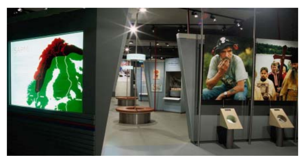
Fig 1. The Sami Culture exhibition (1973) of Tromsø Museum: entrance view.

Key words: indigenous, Sami, representation, museum, public