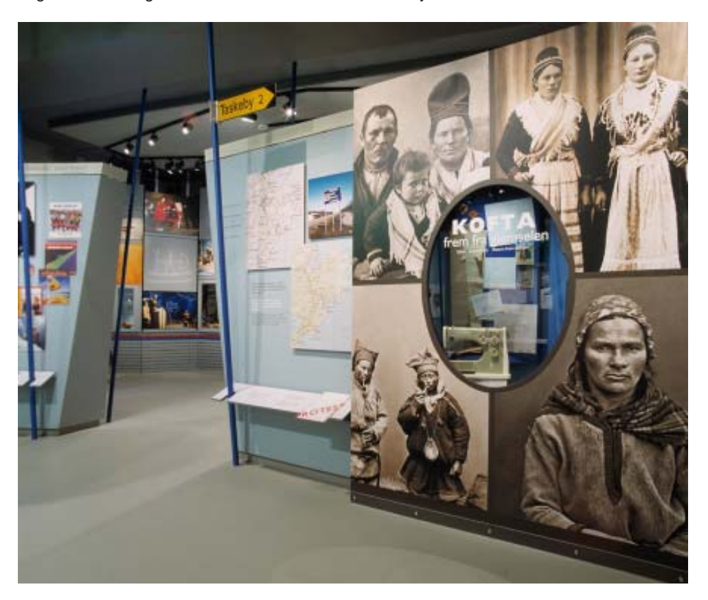
Fig 11. Sápmi: 'room 2' – display 'Return from oblivion' of the movement for researching and taking into use old (and lost) dress traditions, and the issue of Sami place names (including a local protest against their use on road signs).

In Sápmi , the displays are organized in four interconnected rooms of approximately 200 square metres altogether. In the first, visitors encounter a display of 11 large portraits of individual Sami representing the broad range of socio-cultural roles and professions that Sami today occupy.<sup>11</sup> By this, we mean that the presentation is about Sami persons with a variety of occupations, life careers, opinions and conflicts, which gives shape to the dynamic relationship of Sami to the larger world during the latter half of the twentieth century.<sup>12</sup>