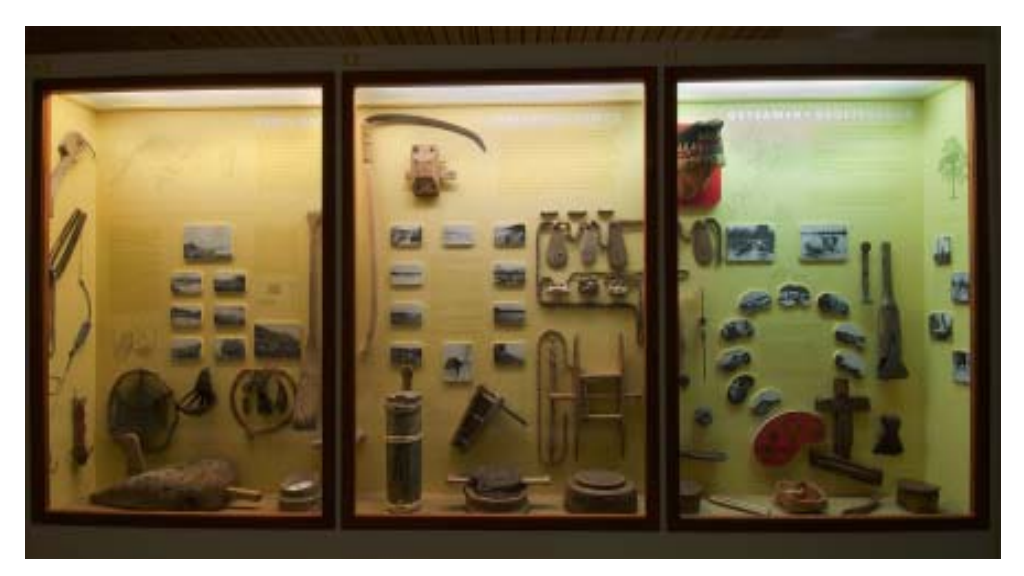
Fig 5. The Sápmi exhibition (2000) of Tromsø Museum: view from the 'introduction room' of the entrance to exhibit (map) and into the displays of the three rooms of the exhibition.

The idea of the project was developed in discussions among the academic staff of the department of Sami Ethnography in the museum. Some of the staff have relatively long careers as university anthropologists; others have their main experience from anthropological museum work.<sup>3</sup> However, we share common experiences on the Sami-Norwegian discourse achieved through various forms of research, impact studies, committee reports, exhibitions and cultural inheritance projects in the field of Sami studies. We have all done fieldwork in Sami-Norwegian