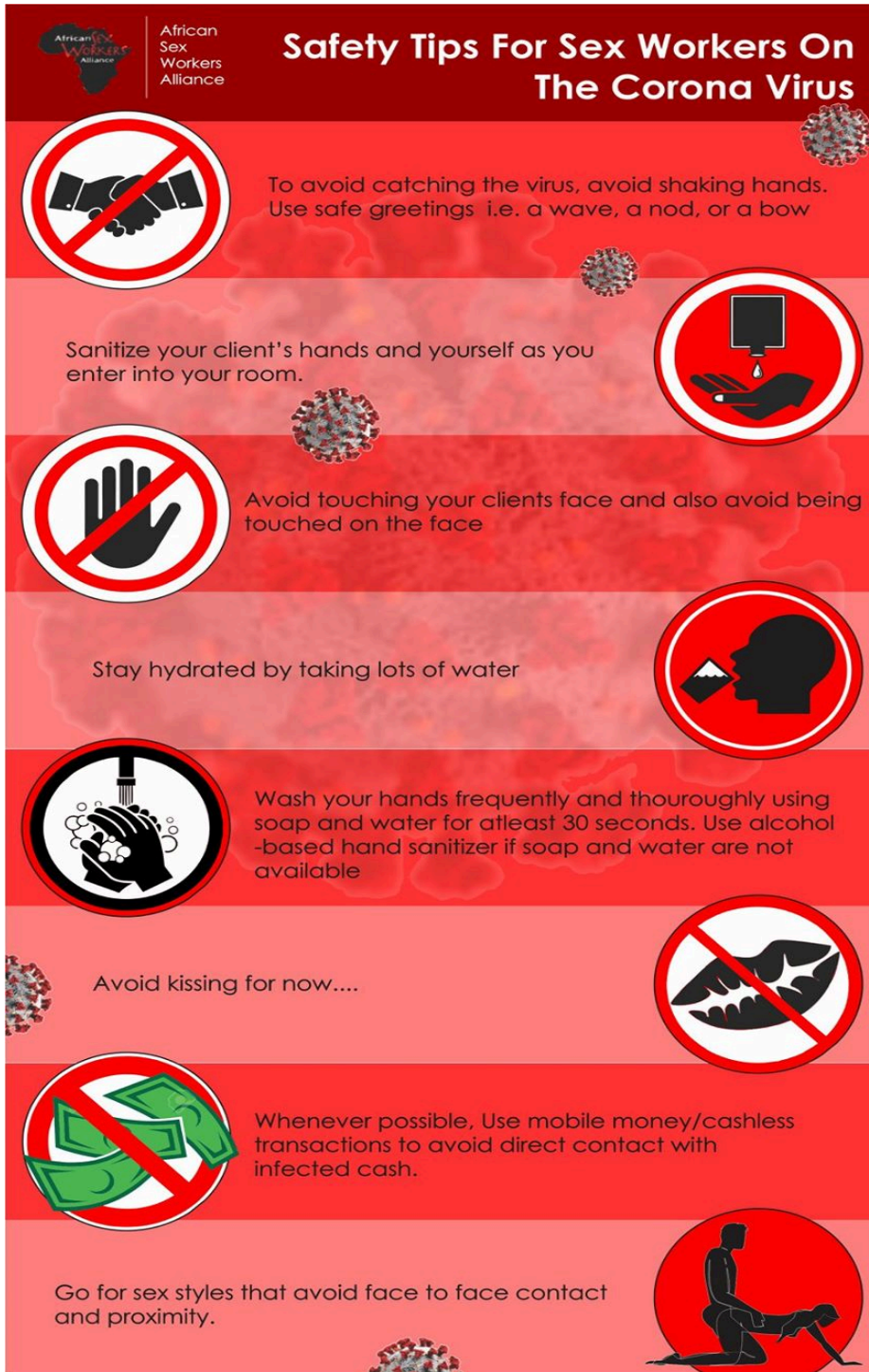
Figure 2: ASWA Safety Tips for Sex workers During COVID.