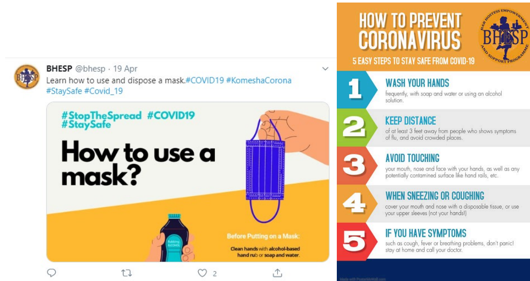
Figure 3. Information from BHESP to sex workers shared via social media

Concern was also expressed that there would be consequences for sex workers health as condom distribution by BHSEP to sex workers was more difficult with known workplaces and residences gone and the organising finding HIV positive sex workers were finding it harder to obtain Anti Retro Viral treatment refills from their clinics. Throughout the crisis BHSEP (through its Facebook, Twitter and YouTube accounts), has provided practical information about coronavirus for sex workers (including information about HIV and HIV treatment services during the corona virus pandemic) and services available. Practical tips around hand washing and wearing a mask correctly were promoted through their social media posts (see Figure 3).