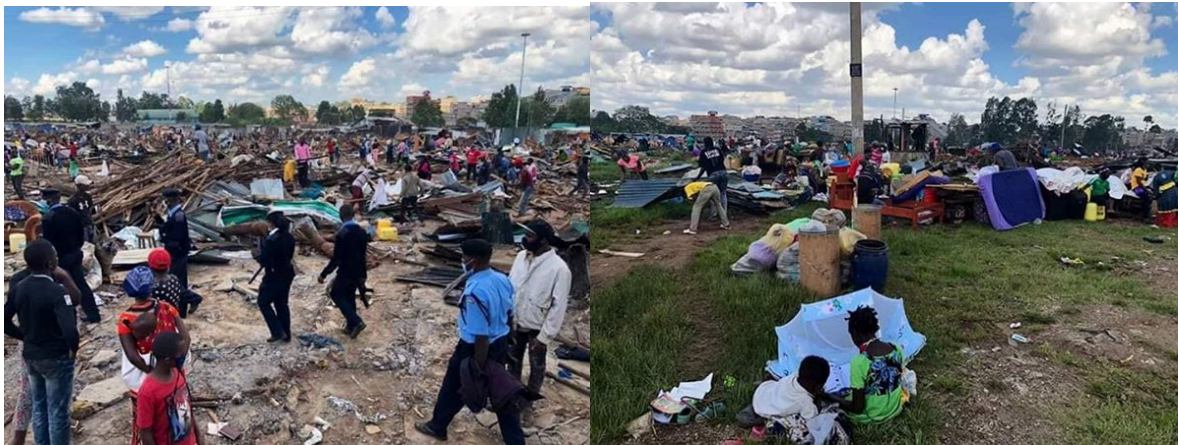
showing the aftermath of the demolitions in Korogocho.

the destruction of homes and business by the Nairobi City Water and Sewage Company. Buildings were bulldozed making 5000 people homeless. Many of these people made homeless were sex workers, adding destitution to the list of hardships.