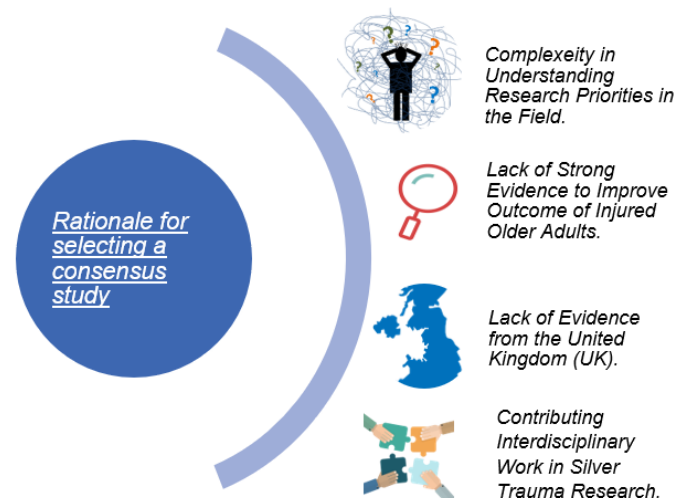
Figure 1: Rationale for selecting a consensus study to determine the top issues in this field to enhance research.

identify and prioritise research issues in this field and discuss promoting such interdisciplinary work in the future research of silver trauma. Drawing upon the issues identified in the literature and expert opinion, this study aims to identify, investigate, and prioritise the top research questions for improving outcomes of injured older adults. The study will also highlight the current issues in trauma care for older people and contribute a collaborative and interdisciplinary work among experts who are interested in trauma care for older people. Summary of the rationale for conducting this study is presented in Figure 1.