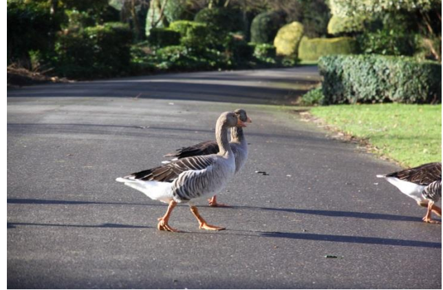
Figure 3 – A pair of Taiga Bean geese crossing a road. The subject of our calculations is in front [6].

the photographer. The photograph (figure 3) was taken with a Canon T1i, which has a sensor size of 22.3 x 14.9mm [4]. The picture itself has dimensions of 4752 x 3168px and was taken with a focal length of 85.0mm. The height of the goose in the picture is 1302px, and the average Taiga Bean goose has a height of 30.3cm [5]. We assume no distortion, and equal sensor horizontal and vertical pixel spacing.