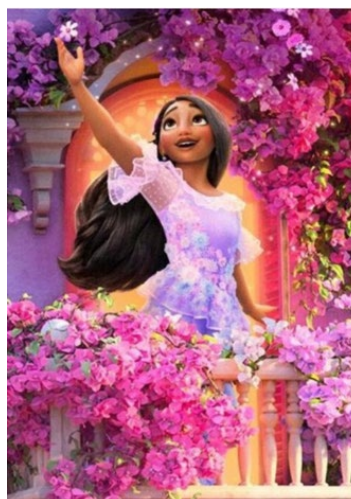
Figure 1 – Isabela Madrigal is posing with the flowers she has grown [3].

The H + is acidic- an increase of H + correlates to higher acidic levels. As the CO 2 levels increase in the atmosphere, the amount absorbed by the ocean increases which in turn, acidifies it. In the last 200 years, the oceans pH levels have decreased from 8.2 to around 8.1 – due to the logarithmic nature of the pH scale, this is a 30% increase [6]. The pH is expected to decrease to 7.7 by the year 3000. This change in the chemistry of the ocean is detrimental for the residents of the waters [5]. For example, coral reefs erode due to the acidity causing a loss to habitats. Animals such as urchins struggle to make their carbonate shells in acidic conditions, so they have a higher chance of being crushed and therefore eaten by predators easily. This again disturbs the ecosystem [5].