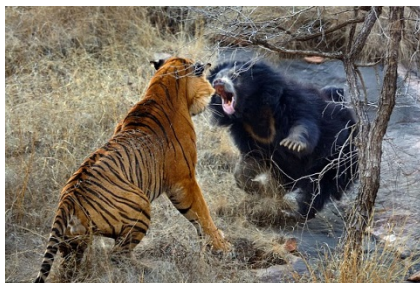
Figure 1 – Bears versus Tigers in a much more literal context [1].

A universal aim in sports is defeating, and commonly achieving dominance, over an opponent. As such, many teams represent themselves with powerful, dangerous animals. However, rather than vying for the Stanley Cup or Commissioner's Trophy, what if teams were competing for life itself?